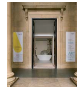
room Art Now

Did you know that the Art Now Space has moved? This room shows a variety of new art from the UK and has up to five exhibitions a year but not all at the same time, the room might burst. Art's got a lot more contemporary since you were last here.