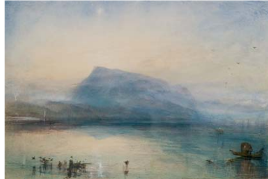
room Clare Gallery

So what's new? Well we've just got The Blue Rigi, Sunrise by JMW Turner after a national fundraising campaign. Result!