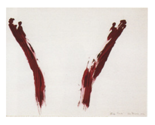
Figs.3–5 Ana Mendieta Body Tracks (Rastros Corporales) 1982 Blood and tempera on paper Rose Art Museum, Brandeis University, Waltham, Massachusetts © Estate of Ana Mendieta Collection

These pieces of paper were taken down from the wall by the artist later that evening in an attempt to preserve some documentary evidence of the event. They appear now as works of art in their own right in the collection of the Rose Art Museum at Brandeis University. Other documents include the photographs commissioned by Franklin Furnace for its slide archive, and oral accounts of some of the audience. Nearly ten years after Mendieta's brief and powerful performance, and six years after the tragic death of the artist in 1985, a subjective recollection of the event was enacted as a staged recreation by one of the original audience members. Nancy Spero was creating a temporary wall installation based on the theme of female victimage at the Von der Heydt Museum in Wuppertal,