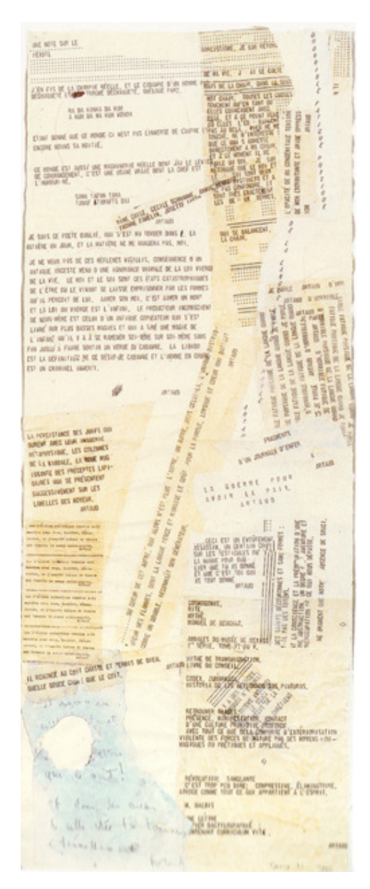
Fig. 13 Nancy Spero Codex Artaud 1971 Panel 27 Typewriting, gouache collage on paper © Nancy Spero