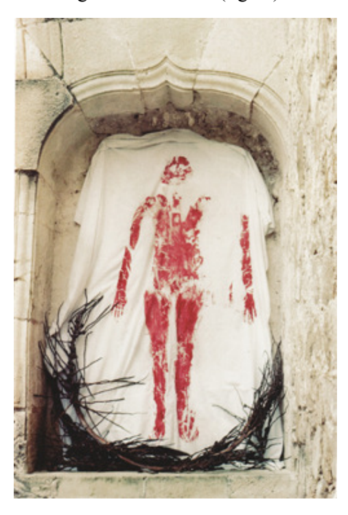
Fig. 10 Ana Mendieta Untitled (Silueta Series, Mexico) 1976 35mm colour slide

This concept of an abbreviated bodily sign can be seen in a photograph of a work by Mendieta which Spero acquired in the early 1990s, at a time when the artist was creating her series of tributes to her friend. Aside from her own work, and that of her late husband Leon Golub, which is contained in the studio by necessity, this photograph is a rare example of another artist's work which Spero has put on display in her personal space. Untitled (Silueta Series) 1973 shows Mendieta's dimensions marked out as a bloody stain on a piece of white cloth which the artist had attached to a stone niche in a wall in Mexico (fig.10). <sup>10</sup> If we were to interpret this work in line with Spero's descriptions in 'Tracing Ana Mendieta', we would consider it to be a stylised symbol of a universal female form as opposed to a bloody 'index' of the artist's body. Perhaps it is the 'trace' of 'the shape of a woman' which Spero writes about in her tribute which she likens directly to 'the recessive mark left by a victim of the bomb in Hiroshima or Nagasaki'. This shadow image – an icon which has become emblematic of the ghostly human imprints left by nuclear genocide – has been adopted by Spero many times as a printed and collaged female figure, and which she imbues with symbolic significance as an archetypal sign of female suffering and endurance (fig.11). <sup>11</sup>