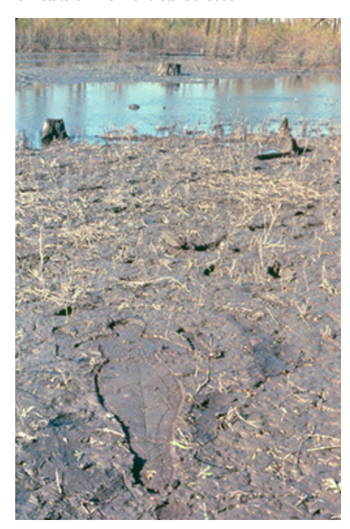
Fig.15 Ana Mendieta Untitled (Silueta Series)1978 Silueta in mud, Iowa Courtesy Galerie Lelong, New York © Estate of Ana Mendieta Collection