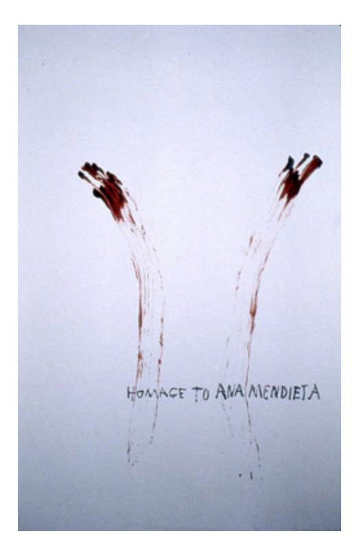
Fig.8 Nancy Spero Homage to Ana Mendieta 1993 Ink on wall (temporary installation) Whitney Museum of American Art, New York © Nancy Spero