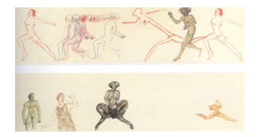
Fig. 16 Nancy Spero The First Language 1981 Hand-printing, printing, painted collage on paper 22 panels © Nancy Spero