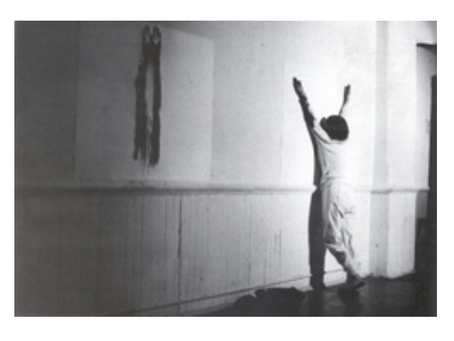
Fig.1 Ana Mendieta Body Tracks (Rastros Corporales) 1982 Photograph taken during a performance at Franklin Furnace, New York City

The resulting hand-prints resembled the representation-by-touch that the French philosopher Georges Didi-Huberman describes in his discussion of the genealogy of the imprint. Published on the occasion of an exhibition entitled L'Empreinte at the Centre Pompidou in 1997, his essay explains how the hand-print is a tactile form of representation that closes the gap between the mimetic reflection and its model, thereby avoiding the dominance of the eye and mind, imitation and idea. In the 1970s this residual sign of presence was conceived as an 'index' in discourses describing conceptual and performance art. The term, drawn from C.S. Peirce's semiotic theory developed in the late nineteenth century, refers to a sign that is connected to its object by a concrete relationship of cause and effect. Common examples are foot prints, weathervanes and symptoms of disease which are signs that are materially acted upon by the objects they seek to identify.