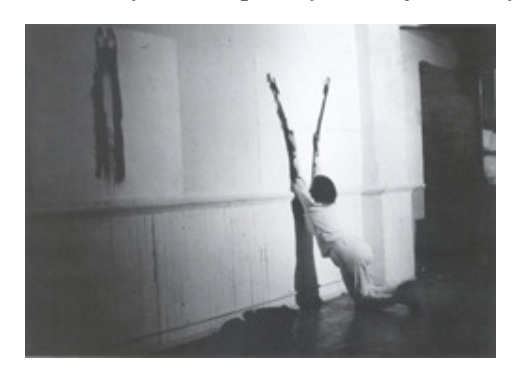
Fig.2 Ana Mendieta Body Tracks (Rastros Corporales) 1982 Photograph taken during a performance at Franklin Furnace, New York City

The resulting hand-prints resembled the representation-by-touch that the French philosopher Georges Didi-Huberman describes in his discussion of the genealogy of the imprint. Published on the occasion of an exhibition entitled L'Empreinte at the Centre Pompidou in 1997, his essay explains how the hand-print is a tactile form of representation that closes the gap between the mimetic reflection and its model, thereby avoiding the dominance of the eye and mind, imitation and idea. In the 1970s this residual sign of presence was conceived as an 'index' in discourses describing conceptual and performance art. The term, drawn from C.S. Peirce's semiotic theory developed in the late nineteenth century, refers to a sign that is connected to its object by a concrete relationship of cause and effect. Common examples are foot prints, weathervanes and symptoms of disease which are signs that are materially acted upon by the objects they seek to identify.