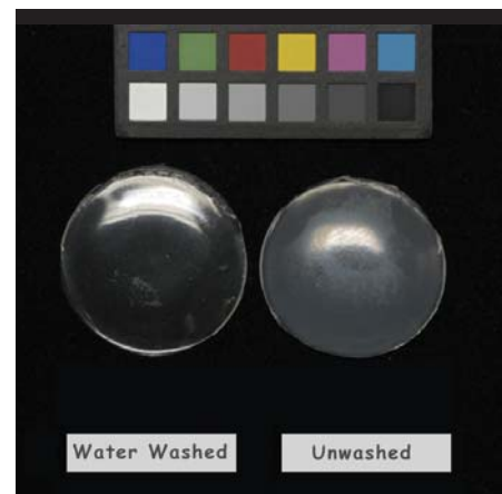
Figure 2: Surfactant Exudates - pours of acrylic dispersion polymer. Right: untreated pour; Left: pour washed/soaked with water. After 2 weeks of drying, this pour was soaked in water for 10 minutes, then dried.