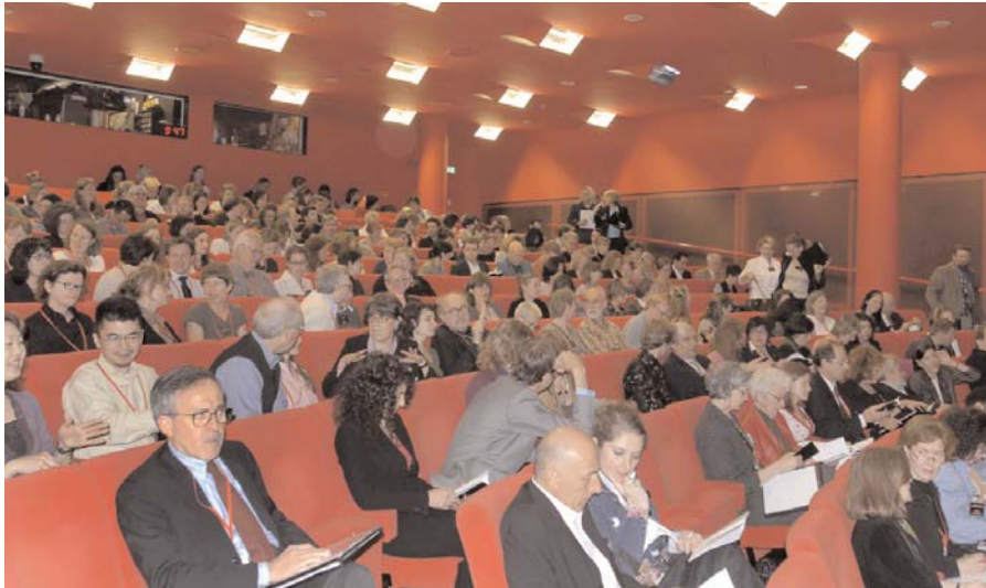
Numerous professionals in the field recently attended the Modern Paints Uncovered Symposium at Tate Modern in London to learn about research regarding modern materials.