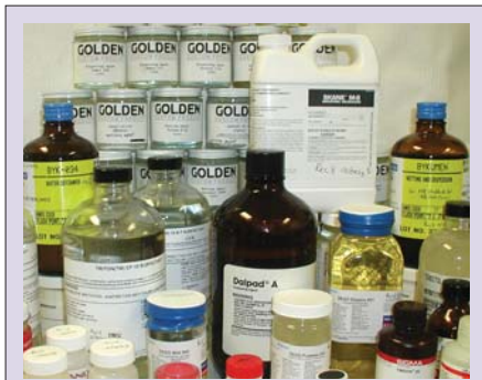
Figure 1: Components of Acrylic Paints