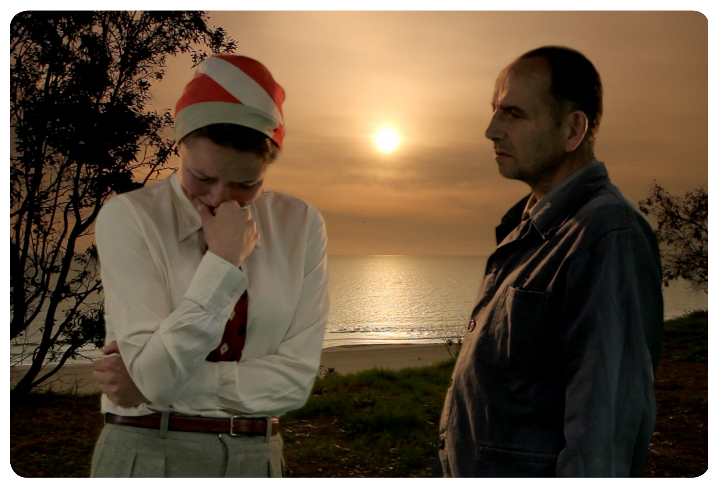
Anja Kirschner and David Panos The Empty Plan 2010, video still. Courtesy the artists and Hollybush Gardens, London. © Anja Kirschner and David Panos

Where theory ends and practice begins, these films address shifting perceptions and socially prescribed behaviours through a combination of real life events and acted scenarios.