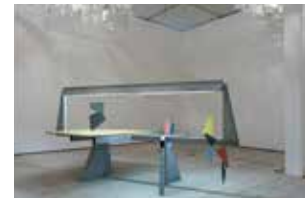
Martin Boyce Do Words Have Voices, 2011, Tate

This installation by the 2011 Turner Prize winner reassesses modernist design and architecture.