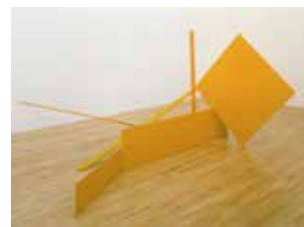
Anthony Caro Yellow Swing 1965 © The estate of Anthony Caro/Barford Sculptures Ltd

This display unites art shown at the revolutionary Kasmin Gallery in 1960s London with recordings of artists and others in National Life Stories' Artists' Lives collection.