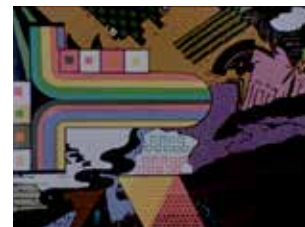
Eduardo Paolozzi Kakafon Kakkoon 1965, film still

The two earliest surviving films by the important 20th century British artist, made from collages of found images and original musical scores.