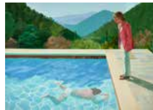
David Hockney Portrait of an Artist (Pool with Two Figures) 1972. Private Collection © David Hockney.

David Hockney returns to Tate Britain in 2017 for his most comprehensive exhibition yet. This exceptional show gathers together an extensive selection of his most famous works celebrating achievements in painting, drawing, print, photography and video across six decades.