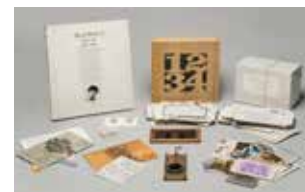
The Nimai Chatterji Collection

Nimai Chatterji amassed a world-class collection of material connected to post-war art movements. This display celebrates our acquisition of his archives, which includes unique letters and documents, rare posters, photographs and more.