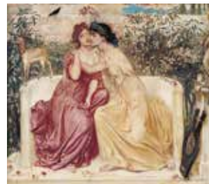
Simeon Solomon Sappho and Erinna in a Garden at Mytilene 1864 Tate

Featuring works from 1861–1967 relating to lesbian, gay, bisexual, trans and queer (LGBTQ) identities, the show marks the 50th anniversary of the decriminalisation of male homosexuality in England. Queer British Art explores how artists expressed themselves in a time when established assumptions about gender and sexuality were being questioned and transformed.