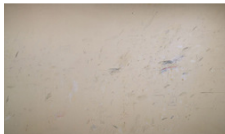
Fig.1 Cy Twombly The Age of Alexander 1959–60 The Menil Collection, Houston © Cy Twombly