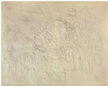
Fig.7 Cy Twombly Academy 1955

In fact, by 1955, a significant change had occurred. Paintings, such as The Geeks (fig.5), Free-Wheeler , Criticism (fig.6), and Academy (fig.7) are inarticulate and unsettled. Though the surfaces are energised, the movement is frenetic and spasmodic. Between 1951 and 1955 Twombly constantly moved from place to place: up and down the East Coast, to Europe and North Africa. Then, for less than a year, in 1953 and 1954, his freedom was constrained by Army service and his assigned duty as a cryptographer. It was during this time that Twombly made what he considers to be breakthrough drawings, brought to fruition in New York in the 1955 paintings.