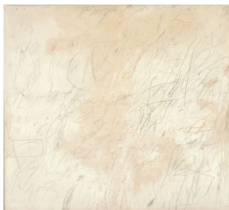
Fig.9 Cy Twombly Arcadia 1958 Courtesy Daros Collection, Switzerland © Cy Twombly

For Olson, the activity – the process – of forming was a uniquely human mode of intelligence and the source of agency. According to Olson, 'an idea means to see ... Action is to move toward form. To act , then, is to go from to see to to do (to finish is to do, & so to make a poem, or anything 21 – presumably 'anything' like Twombly's Blue Room or Olympia (fig.8) of 1957. These paintings figure instances of apprehension – cascades of spontaneous, incomplete perceptions – sharing a field with more fully developed images moving toward form. Olson used the body as a measure. He regarded each utterance to be an evocation of a moment's energy, a physical exhalation of sorts, discharged without pausing to find the mot juste or, in Twombly's case, the elegant line. Everything is put into motion, relationships occur, energies are transferred, and forms emerge naturally from content. 22 Twombly's haphazard, half-written words and poorly-determined strokes create a form uniquely his own, a hybrid of painting and poetry emanating from bodily surges of expression. Moreover, growing out of the context of Italy, the energy of these paintings seems euphoric and free-spirited compared to the taut productions made in America. For example, Arcadia (fig.9), of 1958, vibrates with 'kinetic' events and with Twombly's 'choices' to merge his energy with ephemeral whiteness and Poussin's legacy.