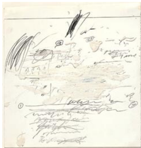
Fig.10 Cy Twombly Poems to the Sea 1959 Dia Art Foundation © Cy Twombly