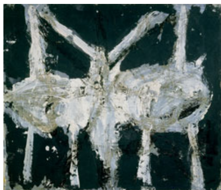
Fig.2 Cy Twombly MIN-OE 1951 Robert Rauschenberg Foundation Collection © Cy Twombly

For myself the past is the source (for all art is vitally contemporary). I'm drawn to the primitive, the ritual and fetish elements, to the symmetrical plastic order (peculiarly basic to both primitive and classic concepts, so relating the two). 6