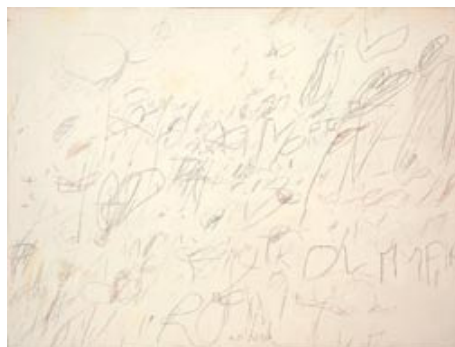
Fig.8 Cy Twombly Olympia 1957 © Cy Twombly

of rhythm is image of image is knowing of knowing there is a construct 20