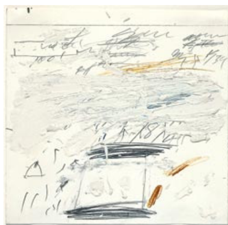
Fig.11 Cy Twombly Poems to the Sea 1959 Dia Art Foundation © Cy Twombly

The series, Poems to the Sea (figs.10, 11), of 1959, makes manifest Olson's demand that humans must find their proper relation to nature and look to it for the principles of formation that ceaselessly advance from it. In 1957 Twombly described a 'synthesis of feeling, intellect etc. occurring without separation in the impulse of action.' 23 As Olson would have liked, each image is a site of activity – of sensate energies transformed to intellection, then action. As a group, we see serial experimentation and a succession of phenomenological states. An open architecture of knowledge emerges – instinctual, emotional, abstract, logical – all formed from nature organically, if not always coherently or smoothly.