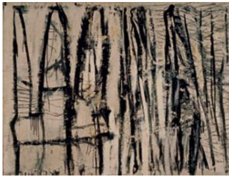
Fig.4 Cy Twombly Quarzazat 1953 Courtesy Gagosian Gallery, New York © Cy Twombly

True to his words, Twombly produced paintings and sculpture that conjured the past. MIN-OE , 1951 (fig.2), is one of a group painted at Black Mountain, inspired by the anthropomorphic, often doubled, forms of Luristan bronzes. Tiznit (fig.3) and Quarzazat (fig.4), both of 1953, relate to places and traditional structures that he encountered on his subsequent trip to Morocco.