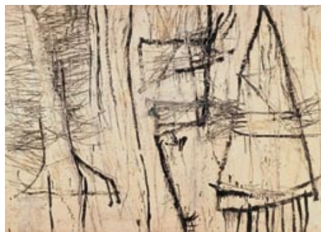
Fig.3 Cy Twombly Tiznit 1953 Courtesy Gagosian Gallery, New York © Cy Twombly