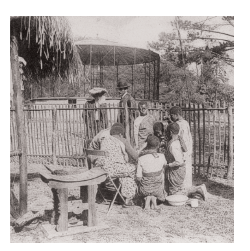
Fig. 85 Postcard, 'Ashantis – The Meal' (detail)

differences. Initially, however, they have difficulty identifying either: they compare both the Annamites and the Bretons to themselves and become confused. Perhaps this unease is comparable to that provoked by The Equatorial Jungle 1909 (no.29). What exactly, is the creature hidden behind the palm leaves? It is at once recognisable and strange. In such a way, Rousseau's peaceful exotic, symptomatic of an era of encounters, raised an important consideration: was there such a great difference between the French and the 'Other'?