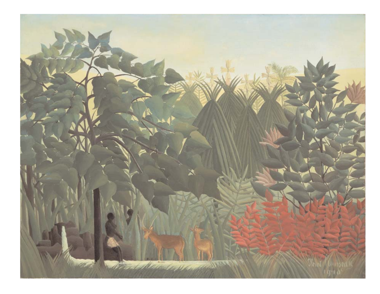
No.23 The Waterfall 1910 Oil on canvas 116.2 x 150.2 cm The Art Institute of Chicago. The Helen Birch Bartlett Memorial