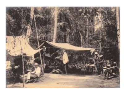
Fig. 82 Marcel Monnier Camp at Dibi (Sanwi) Binger Mission from the Ivory Coast to the Sudan, 1891–2 (detail)

In an age of colonial expansion, in the popular press and elsewhere, images of Western man at ease in the jungle were manifold. This was the period of large-scale expeditions; many great explorers made their names in the years spanned by Rousseau's career. However, with a few rare exceptions, only groups of animals populate Le Douanier's idyllic jungle scenes. The stars of his Monkeys in the Jungle 1910 (no.25), his Exotic Landscape 1908 (fig.81) and the Tropical Forest with Monkeys 1910 (no.27), are all groups of primates. However, if these animals are not human, they are as European as Rousseau's portrait sitters. Some of the creatures – such as the flamingos in the canvas of the same name of 1907 (no.24), or the pair of Himalayan 'semnopithèque' in his Monkeys in the Jungle – are visual quotations from the Bètes sauvages album that Rousseau kept in his