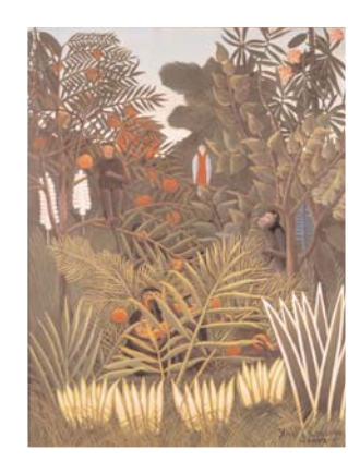
Fig. 81 Exotic Landscape 1908 Private Collection, New York

'Come to Mexico! On the high plains the tulip trees bloom Tentacled creepers form the mane of the sun The palette and brushes of a painter they say Colours as deafening as gongs, Rousseau has been there There his life became dazzling'