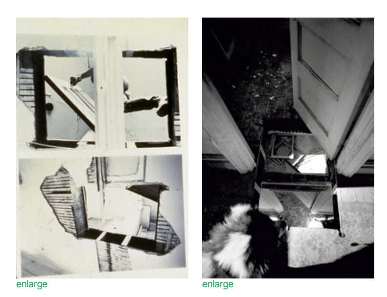
Fig.1 Gordon Matta-Clark Bronx Floors: Threshole 1972 2 black and white photographs Each 356 x 508 mm © ARS, NY and DACS, London, 2007