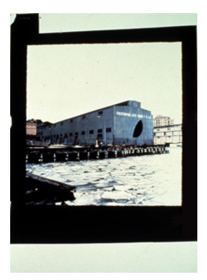
Fig.3 Gordon Matta-Clark Day's End (Pier 52) (Exterior with Ice) 1975 Colour photograph 1029 x 794 mm Estate of Gordon Matta-Clark, GMCT685 © ARS, NY and DACS, London, 2007 enlarge