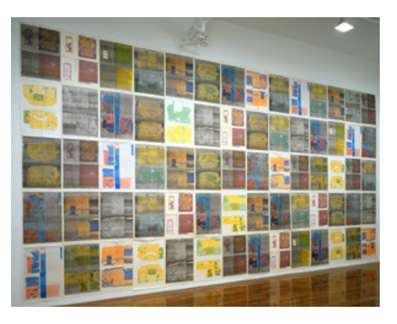
Fig.14 Gordon Matta-Clark Wallspaper Installation 1973 Multiple copies of colour offset prints 72 sheets, each 873 x 568 mm Installation dimensions variable Estate of Gordon Matta-Clark, GMCT2390. © ARS, NY and DACS, London, 2007 enlarge