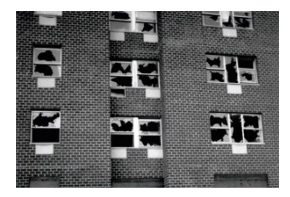
Fig.16 Gordon Matta-Clark Window Blowout 1976 Photograph mounted on board 406 x 559 mm Estate of Gordon Matta-Clark, GMCT3025. © ARS, NY and DACS, London, 2007 <u>enlarge</u>