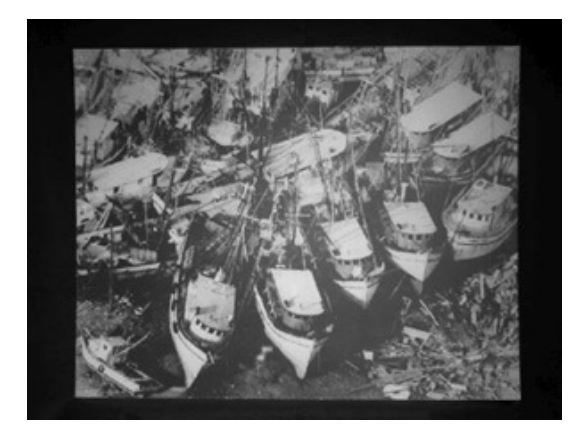
Fig.12 Photograph from Anarchitecture 1974 Estate of Gordon Matta-Clark. © ARS, NY and DACS, London, 2007 enlarge

Fig.11 Photograph from Anarchitecture 1974 Estate of Gordon Matta-Clark. © ARS, NY and DACS, London, 2007 enlarge