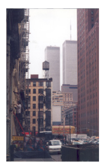
Fig.15 Photograph of the Twin Towers, New York 2001 enlarge

Beyond this, the power of Towards a New Architecture was largely due to its combination of image and text, its revolutionary design refined during the original publication of the essays in the pages of the journal Esprit Nouveau . Le Corbusier was bringing a magazine aesthetic to the book, allowing the images to have a separate and distinct life to his words. The images had to be countered directly, Matta-Clark forced to become as avid a rummager through press cuttings as the Swiss architect himself – hence Le Corbusier's already touchingly dated steam-powered ocean liners are rebutted by an image of a sinking ship upended, disappearing beneath the waves. In a notebook Matta-Clark proposed that Le Corbusier's beloved aircraft should also be pilloried: