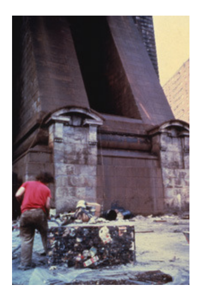
Fig.17 Gordon Matta-Clark Creating Garbage Wall for Fire Boy at the Brooklyn Bridge 1971 Colour transparency <u>enlarge</u>

Where Le Corbusier offered a mass-produced utopia, built on strictly functionalist foundations, Matta-Clark offered a model of what could be achieved both by individuals and at the level of the small collective, that through informal but intense discussion and shared experience could act as a hothouse for new ideas. Which, if we are still trying to pin down the word Anarchitecture, is probably as good a definition as we are going to get.