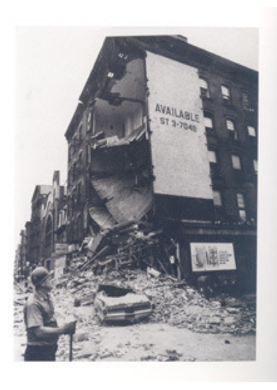
Fig.13 Photograph from Anarchitecture 1974 Estate of Gordon Matta-Clark. © ARS, NY and DACS, London, 2007 enlarge