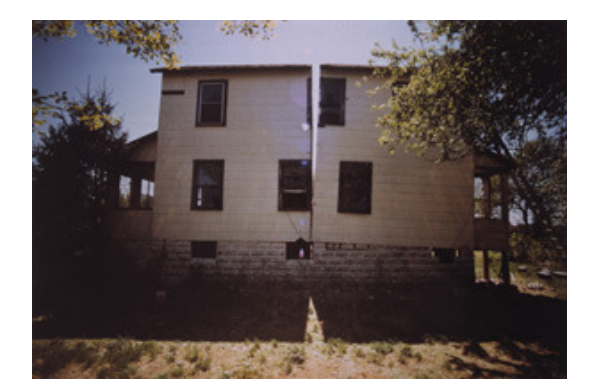
Fig.2 Gordon Matta-Clark Splitting 1974 Colour photograph 680 x 990 mm Estate of Gordon Matta-Clark, GMCT1051 © ARS, NY and DACS, London, 2007 enlarge