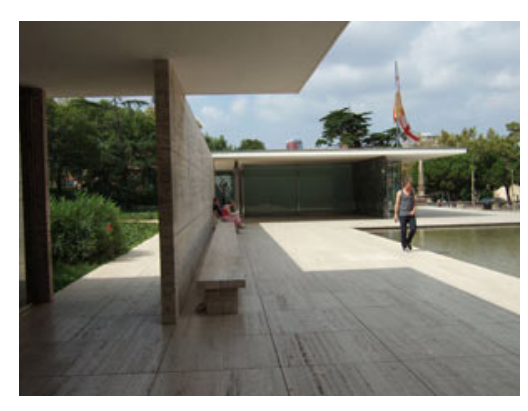
Fig.6 The Barcelona Pavilion, 2007 © Lucy Gunning