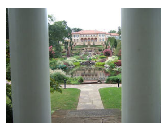
Fig.5 The Philbrook Museum, 2007

VW Hal Foster defines how archival art works 'serve as found arks of lost moments in which the here-and-now of the work functions as a possible portal between an unfinished past and a reopened future'.<sup>4</sup>