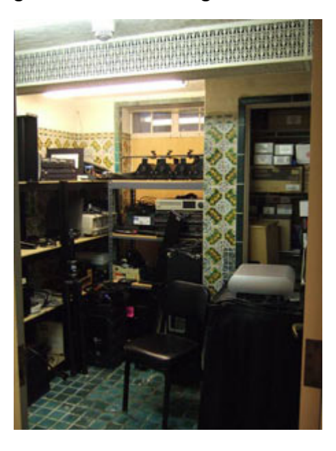
Fig.8 Bathroom/store at the Philbrook Museum, 2007

LG At one point I wondered if the work should involve recordings of these stories, but I was not recording them and I needed them to just be what they were, a spoken exchange. These conversations and stories determined what I discovered and what I interacted with. I became very informed about the museum. It was an investigative process and much of the information I gleaned remained tangential to the final work but I could not have arrived at the work without it.