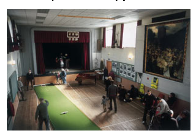
Fig.1 The Village Hall Event, Grasmere, 2007 © Lucy Gunning

VW Could you describe why you were attracted to the site of the Village Hall in Grasmere?