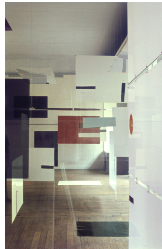
an Exhibit (in association with Victor Pasmore and Lawrence Alloway), record of installation at Institute of Contemporary Arts, London, 1957