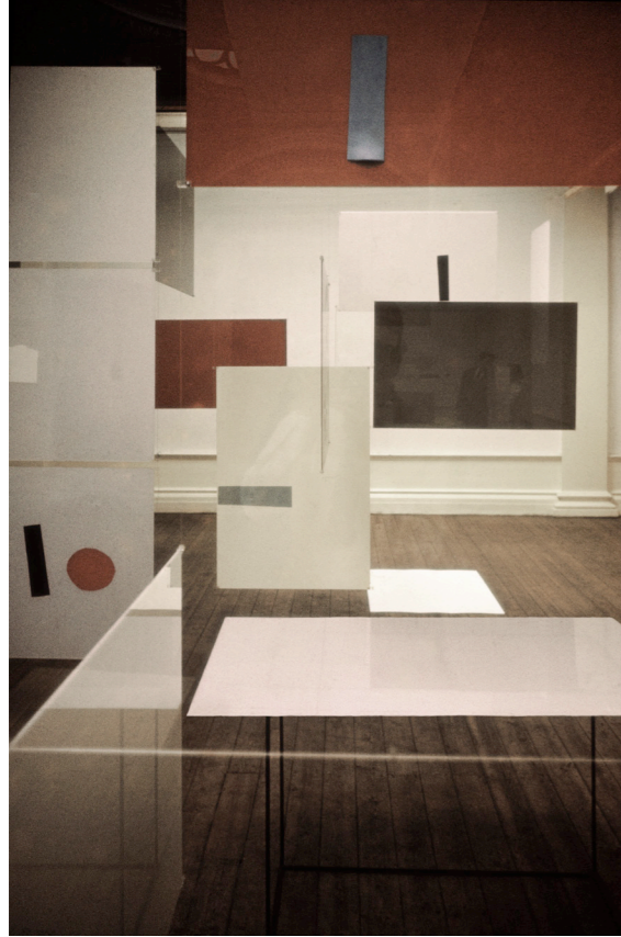
an Exhibit (in association with Victor Pasmore and Lawrence Alloway), Hatton Gallery, Newcastle upon Tyne, 1957