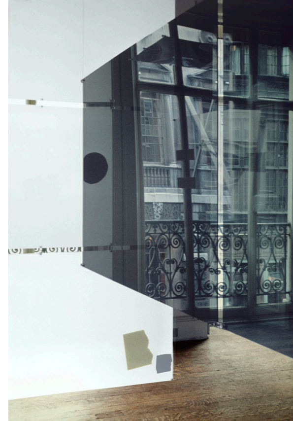
an Exhibit (in association with Victor Pasmore and Lawrence Alloway), record of installation at Institute of Contemporary Arts, London 1957 Copyright Richard Hamilton