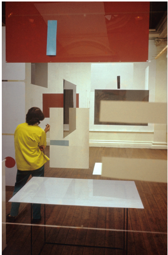
an Exhibit (in association with Victor Pasmore and Lawrence Alloway), Hatton Gallery, Newcastle upon Tyne, 1957