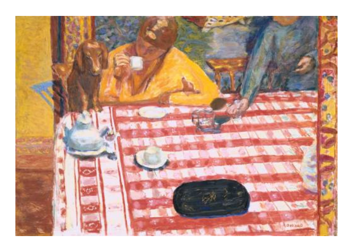
Pierre Bonnard Coffee 1915 Oil on canvas, 73 x 106.4 cm Tate Gallery © ADAGP, Paris and DACS, London 2008