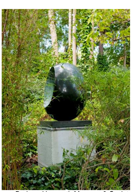
Barbara Hepworth Museum & Sculpture Garden

The Visiting Group programme can cater for groups of all ages with a range of resources to support independent access. Your visit can be enhanced by engaging with a range of talks and artist-led activities at both Tate St Ives and the Hepworth Museum & Sculpture Garden.