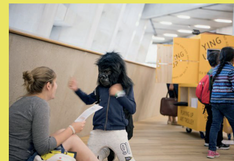
A family using the Playing Up activity