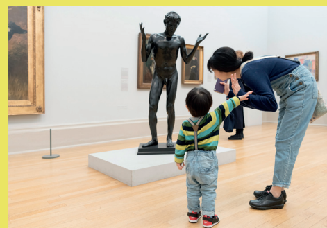
Under 5s explore the gallery at Tate Britain

Family tickets are available for all our special exhibitions, on the Lower and Main floors – and kids under 12 go free (up to four per parent or guardian).