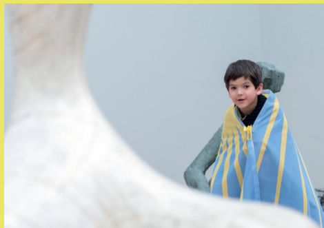
Playing Up at Tate Britain

Tweet our Family Twitter @tate or #tatefamilies or leave us some feedback and any ideas you have to collect your special Tate Star sticker.