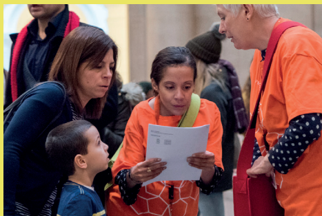
Our friendly team are happy to help

You will find the toilets, baby change, cloakroom and cafés on the lower floor. Feel free to eat picnics in any non-gallery spaces or outside in the Millbank garden or visit the Clore Centre for a quiet place to eat and relax.