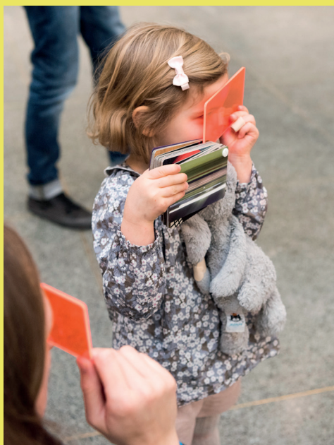
Family activities available at any of the Information Desks

Come along on the first Saturday of every month to work with an artist and discover journeys through the galleries together. For families with children 5 years and under. Visit Tate's website to book a spot.