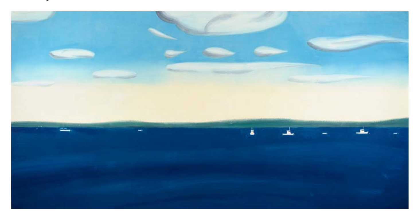
Alex Katz 4.30pm 2007

Katz made landscape paintings in the late 1980s and 1990s, which he called 'environmental', intending the viewer to feel they were in the landscape itself, rather than looking at the painting as a distant observer. This work develops this theme, with the viewpoint appearing to be somewhere on the sea itself. This work also invites closer investigation into Katz' process, with yellow outlining and underpainting evident, especially in the boats.