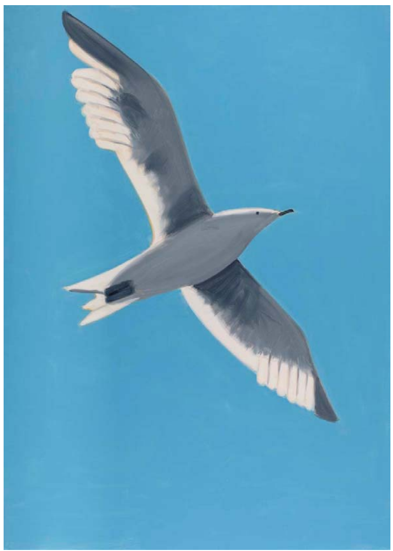
Alex Katz Seagull 2010

The paintings in this gallery depict images from summers Katz spent at his house on the coast of Maine, or family beach holidays further afield. They invite comparisons with the setting of St Ives, the Cornish coastline and its wildlife.