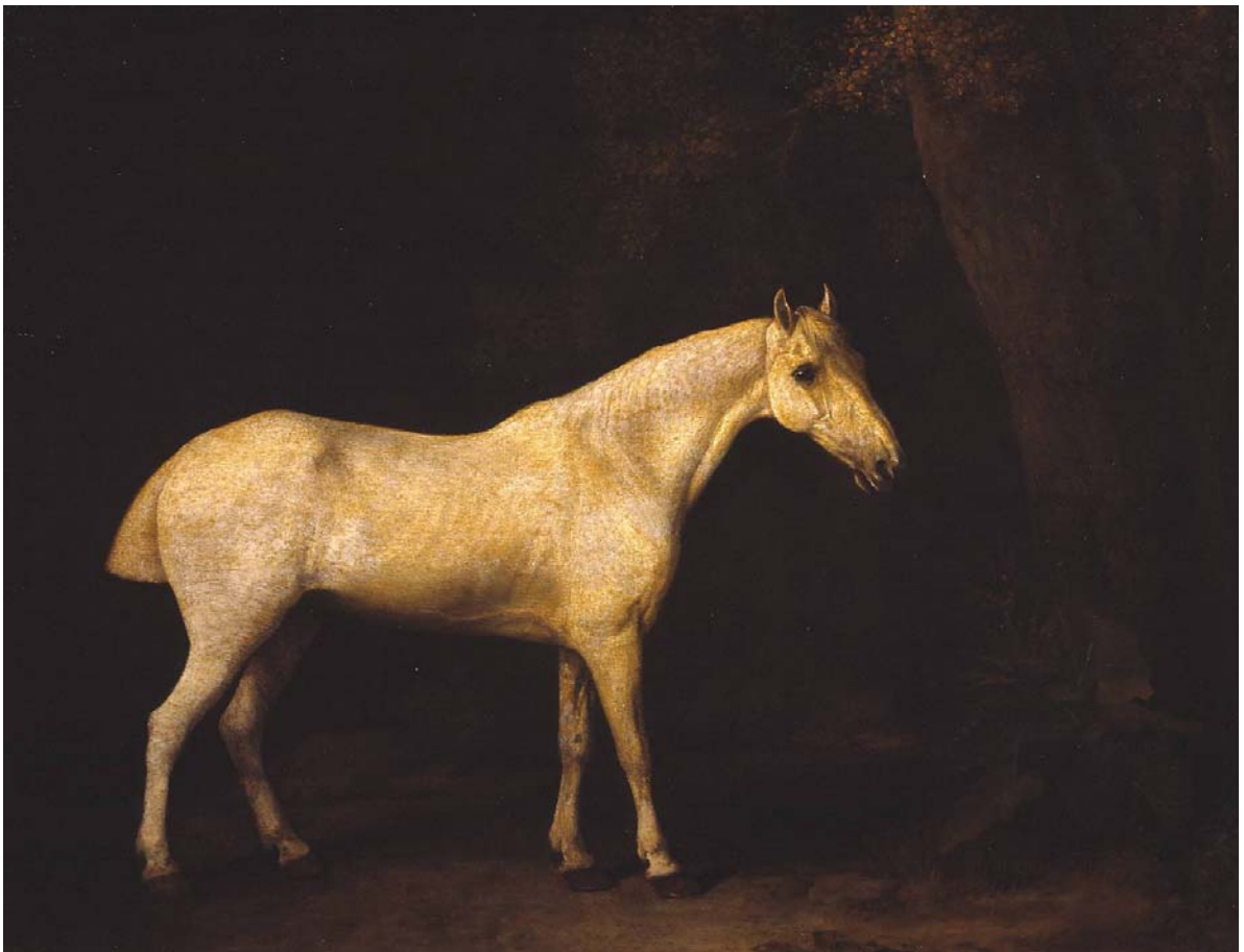
George Stubbs Horse in the Shade of a Wood 1780

Stubbs is known as one of the greatest British animal painters and may have taught himself to paint. He was curious about science as well as art, with a particular interest in the anatomical construction of animals, birds and humans; he performed dissections to further his knowledge. He published The Anatomy of the Horse 1766 which gained him a Europe-wide reputation.