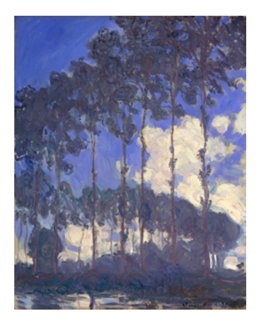
Claude Monet Poplars on the Epte 1891 Oil on canvas Tate