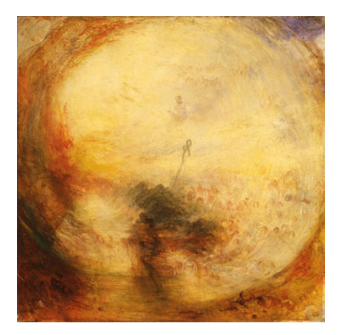
JMW Turner Light and Colour (Goethe's Theory) -The Morning After the Deluge -Moses Writing the Book of Genesis exh 1843 Tate