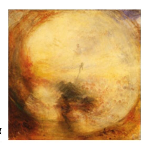
JMW Turner Light and Colour (Goethe's Theory) -The Morning After the Deluge -Moses Writing the Book of Genesis exh 1843 Tate

In later life he gained a reputation for his virtuoso performances at the Royal Academy's Varnishing Days. He would send unfinished canvases to the gallery in advance which were described by a contemporary critic as being 'like chaos before the creation.' He would then proceed to complete the works before an appreciative if not bemused audience, often employing unconventional painting techniques to add to the spectacle.