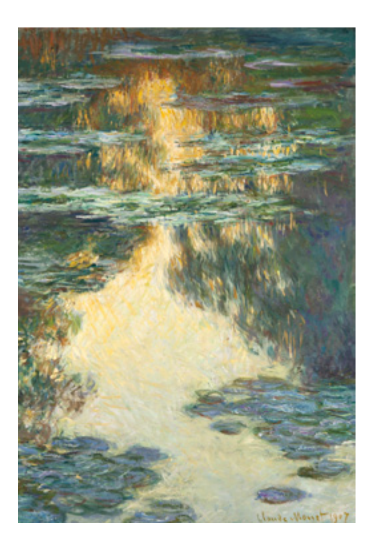
Claude Monet Nymphaéas 1907 Tate