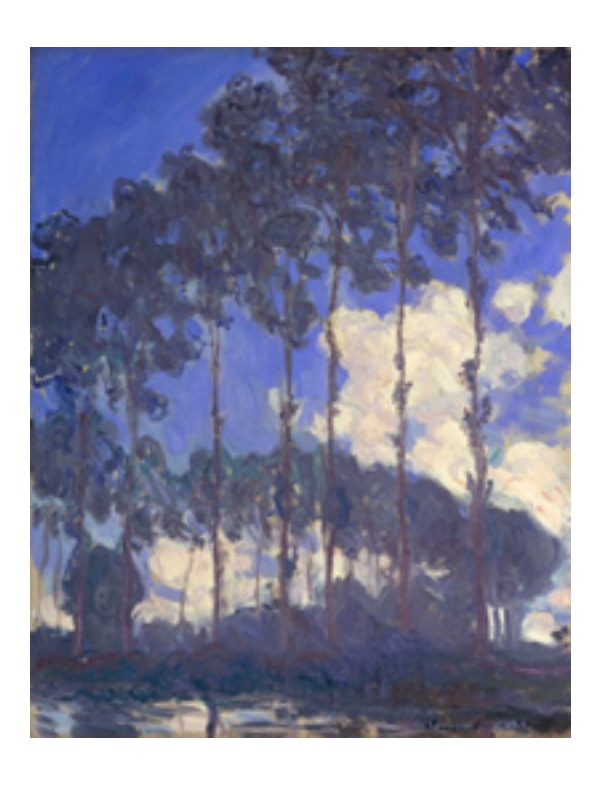
Claude Monet Poplars on the Epte 1891

this group of artists and the style of painting associated with them. Originally meant as an insult, a critic at the first exhibition of this group's work in 1874 scornfully referred to the unfinished appearance of the paintings as 'impressionist' and the name stuck. The impressionist style developed from their method of painting which employed short, rapid brushstrokes in order to capture fleeting atmospheric conditions as they worked directly in front of their subject in the open air. The availability of metal tubes of oil paint meant that they could take their materials out into the landscape, whereas previous artists such as Turner were restricted to boxes of watercolours for sketching outdoors. Besides painting the natural landscape, Monet was also attracted to the man-made environment such as the streets of the developing city of Paris and the newly constructed railway system. When he painted his