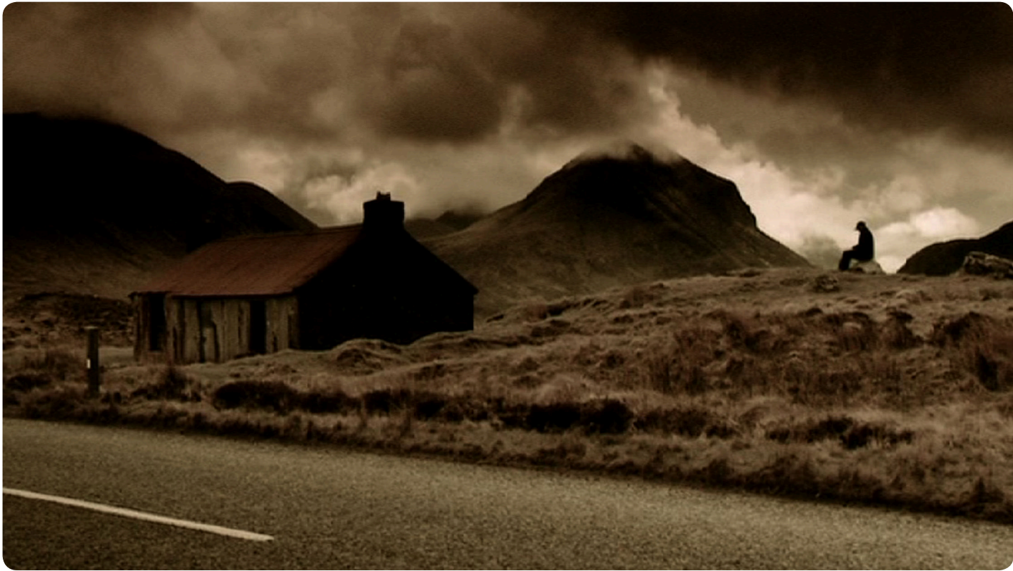
John Akomfrah The Call of Mist - Redux 2012.