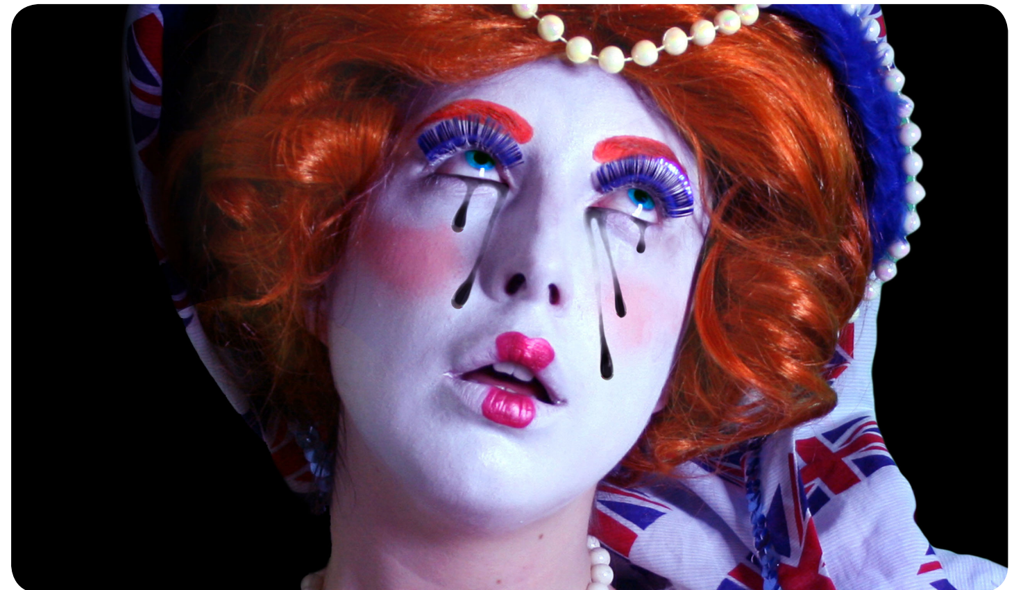
Rachel Madean The Lion and The Unicorn 2012.

This screening marks the UK launch of the international touring programme Moving Pictures presented by the British Council and Film London Artists' Moving Image Network (FLAMIN). Selected works from the tour will be screened and followed by a conversation on the presentation of UK artists' film in an international context.