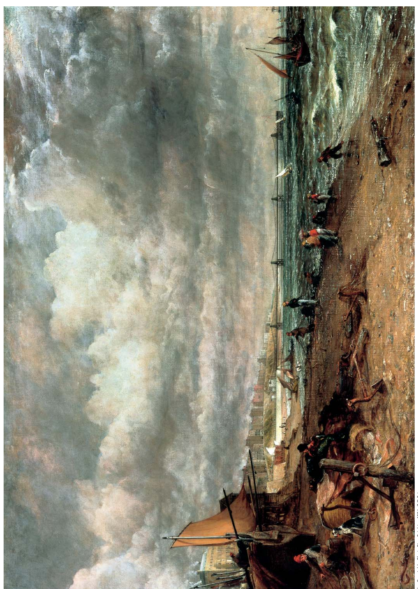
John Constable Chain Pier, Brighton 1826–7