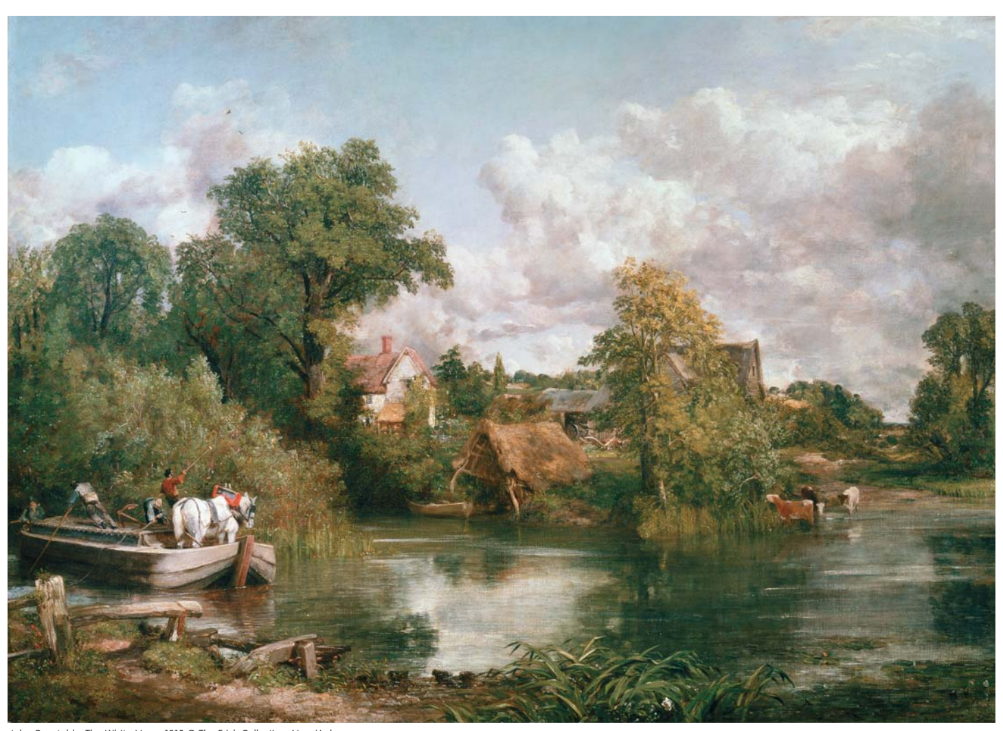
John Constable The White Horse 1819