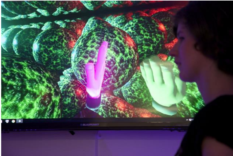
Glitch VR Room