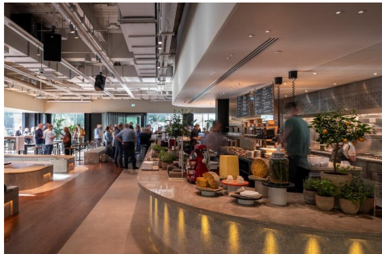
Corner at Tate Modern

Tate Enterprises – our commercial arm overseeing retail, catering, events and licensing – continues to provide a vital income stream for Tate. In the summer they unveiled Corner, a new all-day café and evening bar at Tate Modern. Designed by Holland Harvey, the space is a more welcoming and flexible environment for visitors as well as for a new programme of one-off events to attract more visitors.