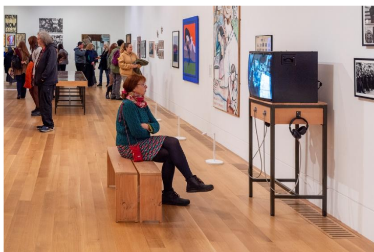
Teachers' Private view of Women in Revolt!

Tate has seen its overall visitor numbers increasing from 5.99 million in 2022-23 to 6.36 million in 2023-24. This is due to a strong programme of exhibitions and events, including successes such as Hilma af Klimt and Piet Mondrian and Philip Guston at Tate Modern. A successful programme at Tate Britain, including Women in Revolt! and Sargent and Fashion , alongside the rehang of the collection displays, also helped to increase visitor numbers. Visits to Tate St Ives have consistently stayed high since the pandemic, showing the enduring appeal of this gallery.