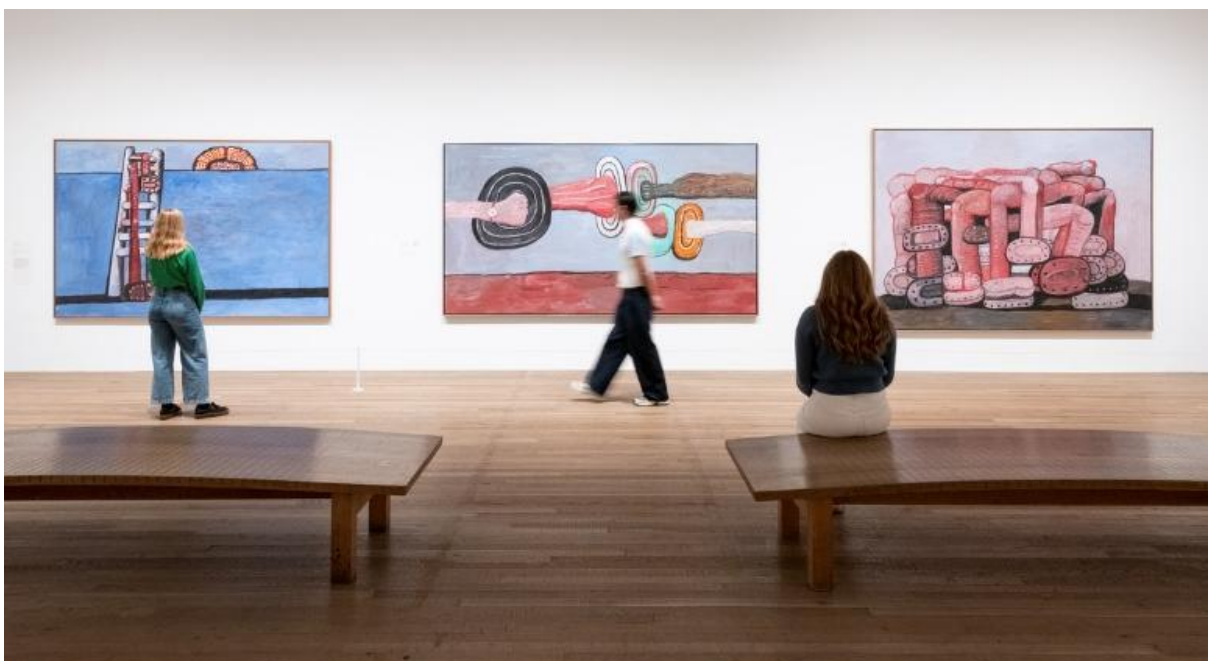
Visitors enjoying Philip Guston

The cultural sector continues to experience challenges in the face of rising energy costs and the long-term impact of Covid-19, but we are working hard to safeguard Tate's future, both financially and environmentally. We were delighted when the Museums and Galleries Exhibition Tax Relief (MGETR) was made permanent and are extremely grateful to Government for the additional support it has given the sector. Further thanks go to everyone who has supported Tate this year in a myriad of ways, and to all Tate colleagues who work so hard to ensure we are artistically adventurous and culturally inclusive in all our four galleries, our digital platforms and our national and international partnerships.