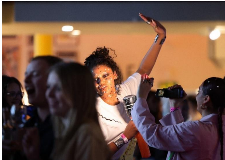
Late at Tate Liverpool: The Spirit of Eurovision

Further community work was undertaken at Tate Liverpool shortly before we closed the doors for major transformation works. We held a celebration designed to offer the local community a last chance to see the collection before the closure, in a weekend filled with activities, talks and music.