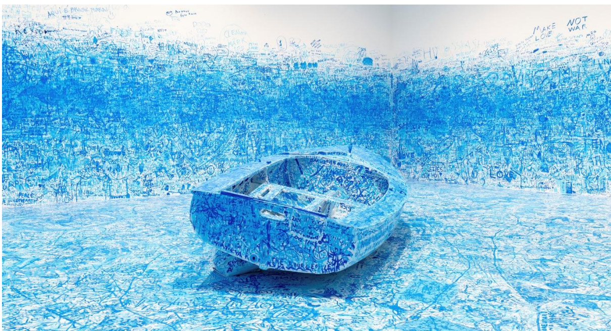
Yoko Ono, Add Colour (Refugee Boat) , concept 1960, London 2024