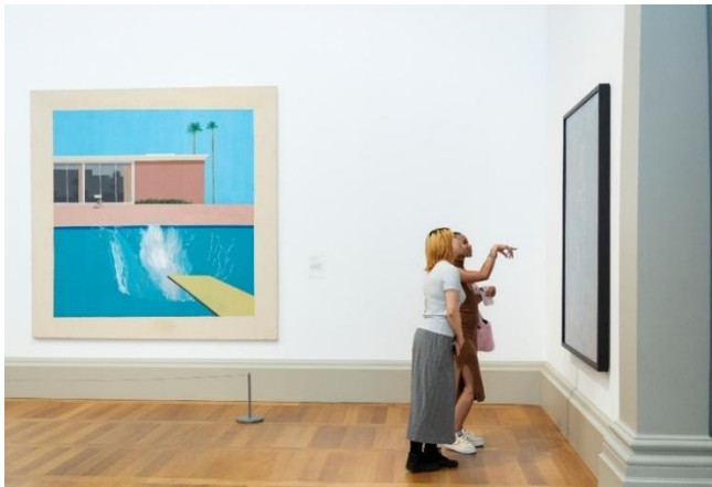
David Hockney's A Bigger Splash on display at Tate Britain

A major project was completed this year, with the first rehang of Tate Britain's collection displays in over a decade. The rehang features over 800 works by over 350 artists, with much-loved and iconic works – from John Everett Millais' Ophelia and David Hockney's A Bigger Splash to Barbara Hepworth's Pelagos and Chris Ofili's No Woman, No Cry – joined by a host of new discoveries and additions. Reflecting the growing diversity of Tate's collection, the displays feature 200 works which were acquired after the millennium, including 70 works which entered the collection in the past five years alone, from grand Tudor portraits to contemporary installations.