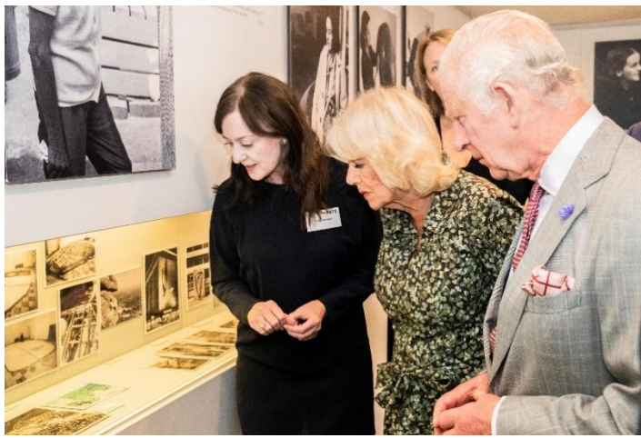
Royal visit to Tate St Ives

This has been a strong and productive year for Tate, with visitor numbers increasing thanks to a compelling programme of exhibitions, displays and events. These included critically acclaimed shows such as Phillip Guston at Tate Modern and Sargent and Fashion at Tate Britain among many others, as well as a touring exhibition programme which has brought Tate's collection to many countries around the world. The rehang of the world's greatest collection of British art has been a success at Tate Britain, and transformative capital projects are now well under way at Tate Liverpool and Tate St Ives.