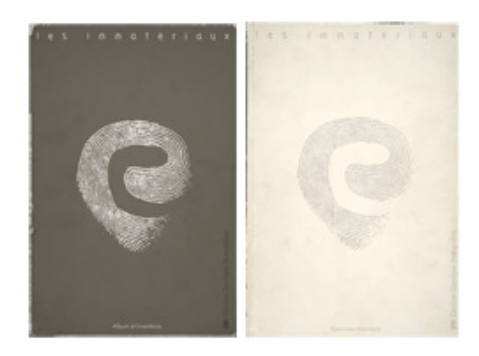
Fig.2 Les Immatériaux exhibition catalogues (left: Album and Inventaire; right: Épreuves d'écriture) 1985 The

The idea of constituting an archive of the communication generated by Les Immatériaux , mediated analogically as well as digitally, also determined the exhibition's catalogues. Instead of the traditional single volume acting as an anticipated record of the completed event, two publications were issued, both of which reflected the process underpinning Les Immatériaux . The first is a folder with, on one side, ' L'Inventaire ' – a sheaf of loose pages each describing one of the exhibition's sixty-one 'sites' – and, on the other, a bound ' Album ' of notes and sketches (most of these by Philippe Délis, the scenographer of Les Immatériaux ) documenting the exhibition's development from La Matière dans tous ses états in 1984 to a snapshot of the installation, presumably taken in early 1985. The second publication, titled ' Epreuves d'écriture ', is a soft-cover bound volume containing the records of a computer-mediated discussion among twenty-six participants – including Daniel Buren, Michel Butor, Jacques Derrida and Isabelle Stengers – of a set of fifty terms proposed by Lyotard. <sup>22</sup> Lyotard held this second volume in high esteem: 'It is probably a "book" that elicits a kind of beauty, as it were, very different from what I was accustomed to. For me it is a great book.'<sup>23</sup> (fig.2)