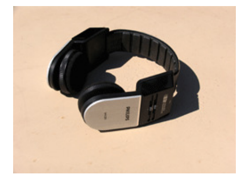
Fig.3 Philips headset used in Les Immatériaux 1985