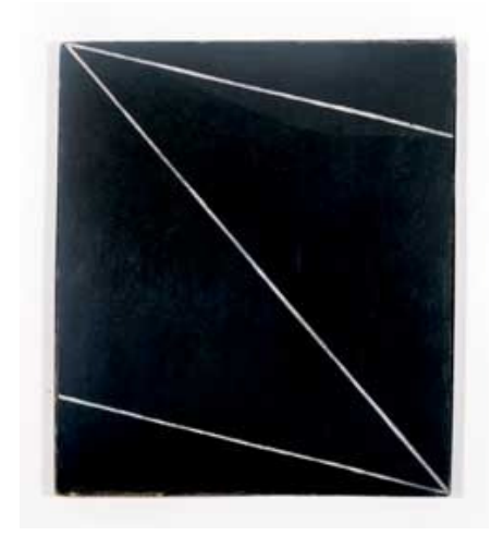
Fig.1 Aleksandr Rodchenko Construction No. 126 1920 Oil on canvas 58.5 x 51 cm Private collection, courtesy of Annely Juda Fine Art, London © A. Rodechenko & V. Stepanova Archive / DACS 2009

Some time around the middle of 1920 the Russian artist Aleksandr Rodchenko produced a remarkable work consisting of a zig-zag white line painted on a black ground and measuring some 58 by 51 centimetres (fig.1). Whether we describe the zig-zag as one line or three will remain for the moment moot. The painting's monochrome ground lacks any texture, but creates a depth behind the zig-zag, which therefore comes to lie in, or on, the picture surface. Titled by the artist Construction No. 126 , the painting raises difficult questions about Rodchenko's struggle in these years to transcend the bourgeois aesthetics of the past and to meet what he took to be the demands of the new revolutionary life. How did he manage that transition, and how successful was he in refashioning art as a technical, experimental activity, in tune with the Communist reorganisation of the country?