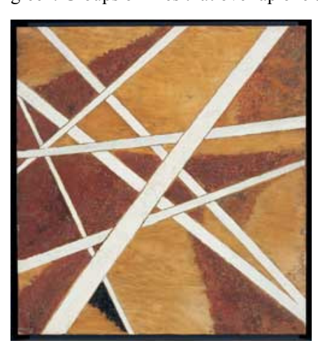
Fig.5 Liubov Popova Space-Force Construction 1921 Oil on plywood 64 x 60 cm State Tretyakov Gallery Moscow, gift of George Costakis

positioning the straight line theoretically as 'primitive', Rodchenko is noting the exact opposite in his diary. 'Thought of painting ten pieces, just black on white, with a ruler', he writes in July 1919. 'It would be exceptionally new. I really need to apply myself to the ruler, claim it as my own'. Indeed, it is within this group that we find for the first time painted lines as such; no longer cuts in the plane, nor planar edges, but straight and nearly parallel lines grouped in any number from three up to about seventeen (fig.4). These lines possess an even thickness, grouped fan-wise or gridded, hovering above a monochrome ground, typically ochre, reddish ochre, or green. Groups of lines that overlap one another may be said to form a pattern more like a trellis than a grid.