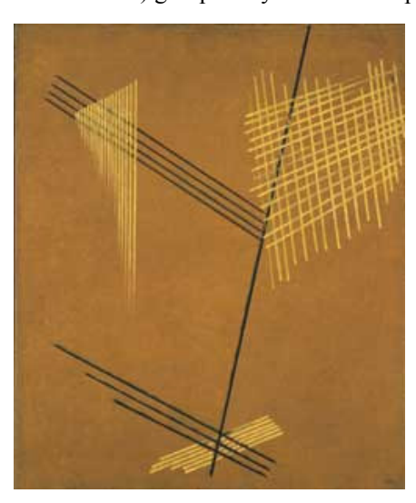
Fig.3 Aleksandr Rodchenko Non-Objective Painting (Line) 1919 Oil on canvas 84.5 x 71.1 cm Museum of Modern Art, New York, gift of the artist 1936 © A. Rodechenko & V. Stepanova Archive / DACS 2009

surface plane', as he later described his paintings of that time.<sup>3</sup> For those works, 'cuts' is indeed the perfect word for the carefully painted slices into the matter of the plane, made to look as if a fissure or flap had been created in visual space (fig.3). By the spring of 1919 he was also working on some sketches for architectural schemes combining volumes in space in the context of his membership of the Zhivskulptark (Painting-Sculpture-Architecture) group. Why then was he preoccupied with lines and linear painting in that year?