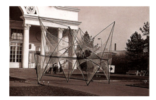
Fig.6 Francisco Infante Installation view of 'Galaxy' at VDNKh, Moscow 1967 Gelatin silver print 5 x 10 cm

In the 1970s the conceptual artist Ilya Kabakov departed from the grid as an untainted geometric structure. Unaware of Rodchenko's practice of using non-objective constructions to deliver a verbal message, Kabakov, in an untitled small ink drawing, infested the grid's inner structure with fragments of communal speech, such as 'How much for what?' and 'Give it to me quickly'. Occupied throughout the 1970s with making albums (loose pages of texts and drawings stored in boxes), Kabakov monumentalised his model of the narrative grid ten years later in a series of mechanically painted (following Rodchenko's monochrome triptych) white masonite works. In one of these panels, titled The Schedule for Taking out the Garbage Can , he reduced the function of the grid to the level of a bureaucratic chart recording collective participation in such repetitive and most mundane chores. (fig.7) In these, perhaps the artist's most original two-dimensional works, he utilised the grid to replace a representation of reality by a construction of its inventory.