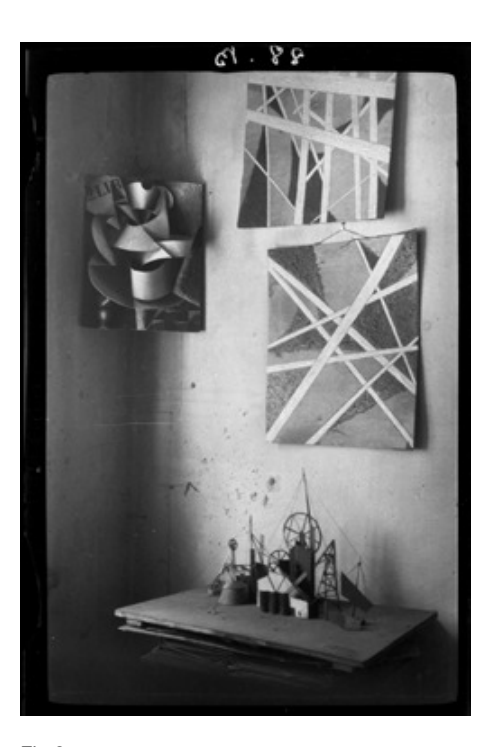
Fig.2 Aleksandr Rodchenko Popova's Studio 1924 Gelatin silver print 25 x 16.5 cm