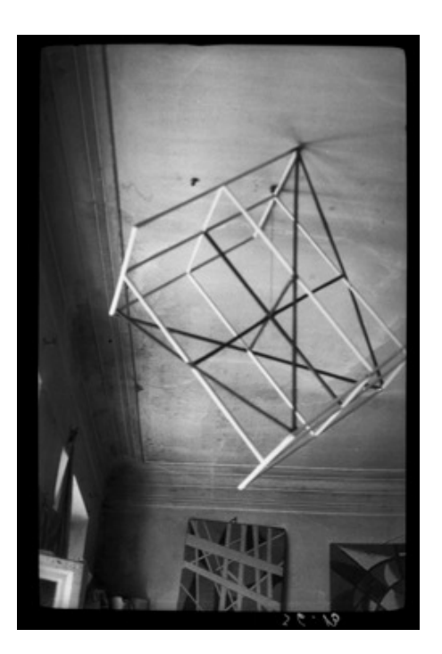
Fig.4 Aleksandr Rodchenko Popova's Studio 1924 Gelatin silver print 25 x 16.5 cm