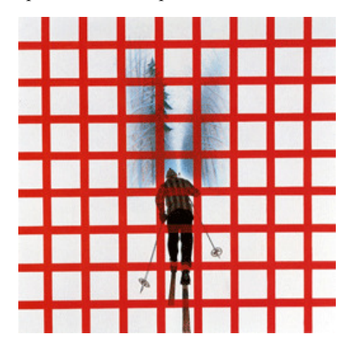
Fig.8 Erik Bulatov Skier 1971–4 Oil on canvas 180 x 180 cm Private collection, Bern

In such works Kabakov may have taken into account the way in which his close friend Erik Bulatov in the early 1970s had combined the grid with perspectival space, thus sort of traveling backwards in time to when, in Krauss's words, Renaissance painters drew 'perspective lattice on the depicted world as the armature of its organisation'. And yet as Bulatov's seminal paintings Entrance 1972 and Skier 1971–4 (fig.8) demonstrate, he did not isolate himself in the distant past. Instead, he effectively confronted key spatial and conceptual taboos that twentieth-century modernists had assigned the grid to guard.