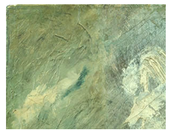
Fig.3 Detail from Sketch for Hadleigh Castle, upper left, showing variations in paint application and crack pattern between addition at left and main canvas at right.

Analysis of paint dispersions found that six out of seven samples from the additions contained a significant amount of yellow in the pigment mixture. Samples from the main canvas showed no such prevalence. Furthermore the painting bears a distinct network of age cracks which one would expect to extend on to the additions if contemporary with the main canvas, but this is not the case (fig.3). Diagonal cracks at upper left indicate the original corner was within the twill canvas rather than skewed to the left where the addition now is.