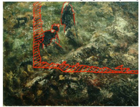
Fig.8 Detail from Sketch for Hadleigh Castle, lower left corner. Area of red striations indicates original paint loss as revealed by the X-ray.

The additional strips of canvas were joined to the ragged edges of damaged canvas<sup>21</sup> and paint applied on top allowed to encroach onto the main body of canvas to reconstruct the lost composition, including the rear and tail of the dog. Thus, the dog and ruin we now see are partly original, partly reconstructed. Lining up painting and X-radiographs, we can see sufficient space within the damaged area to encompass the whole body of the dog (fig.8) and perhaps a slimmer left side to the ruin, but little more.