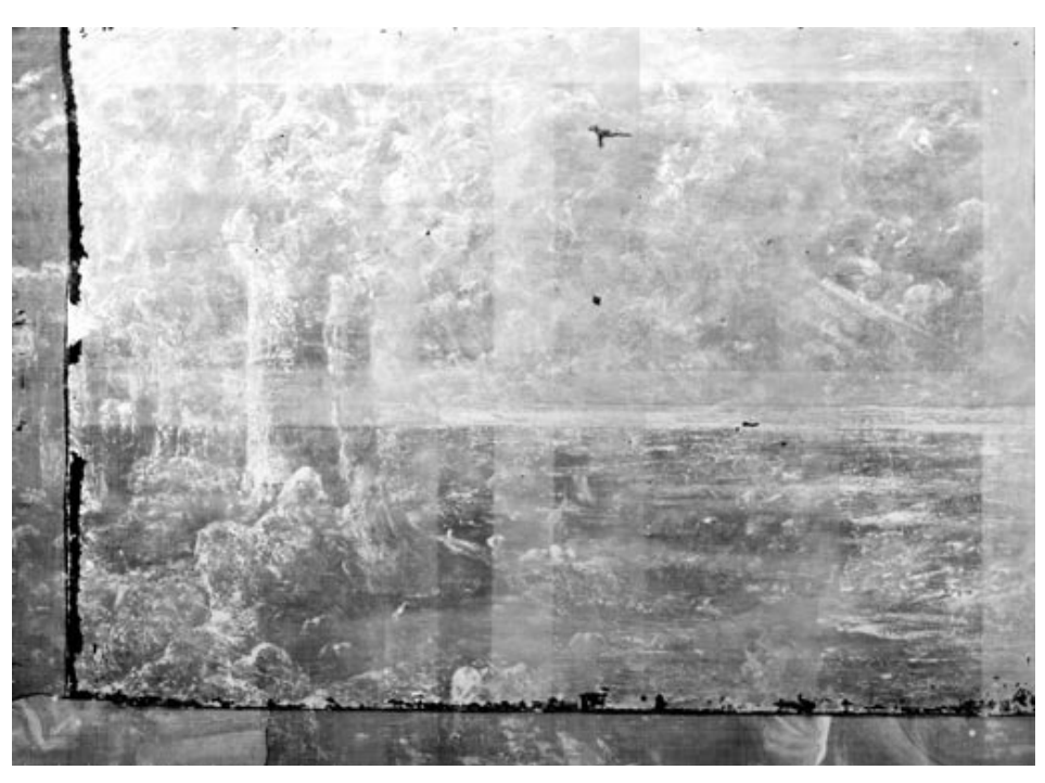
Fig.7 X-ray mosaic of Sketch for Hadleigh Castle .

The additional strips of canvas were joined to the ragged edges of damaged canvas<sup>21</sup> and paint applied on top allowed to encroach onto the main body of canvas to reconstruct the lost composition, including the rear and tail of the dog. Thus, the dog and ruin we now see are partly original, partly reconstructed. Lining up painting and X-radiographs, we can see sufficient space within the damaged area to encompass the whole body of the dog (fig.8) and perhaps a slimmer left side to the ruin, but little more.