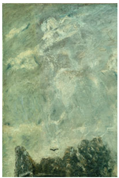
Fig.2 Detail from Sketch for Hadleigh Castle, upper left, showing yellow hue to paint at extreme left edge. Tate Conservation

Unframed and well lit in the conservation studio, the additions stand out from the rest of the composition owing partly, to a marked yellow tonality to the paint, particularly in the sky of the left addition (fig.2).