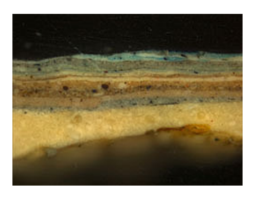
Fig.4 Cross section from Sketch for Hadleigh Castle: sky of main canvas, in normal light at left, UV light at right.

During the second campaign of painting on the additions, three layers of paint were applied (each approximately 50-80µm thick) on top of a fresh ground (fig.5). By contrast, an equivalent cross section from the sky of the main canvas reveals eight, typically 10–30µm thick, paint layers (fig.4).