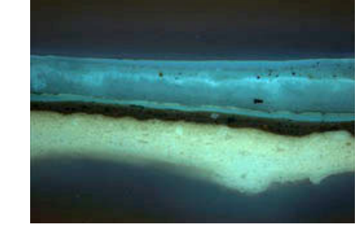
Fig.5 Cross section from Sketch for Hadleigh Castle: sky of left addition, in normal light at left, UV light at right.

As well as this difference in build up, the paint and ground of the left addition have a distinctive blue fluorescence in UV (figs.4–5). It has been suggested that the cause may be wax, added to body the paint to imitate Constable's multilayered technique on the main canvas. Descriptions of Constable's painting technique often cite his use of a palette knife to achieve textured surfaces, and the sky in the Sketch for Hadleigh Castle is a case in point. He author's recent technical examination found no such tool marks on the main canvas. There is evidence in the sky of the left addition, however, in the form of broad flat strokes and ridges of accumulated paint (fig.3), a further discrepancy in paint application between the main canvas and the additions. Another finding from analysis of the additions include: the tentative identification of synthetic ultramarine. Constable thought this inferior to the natural pigment, had it was little used following its invention had in 1826–8. The was therefore unlikely to have been used by Constable for this work or even during his lifetime. Analysis also showed the presence of barium chromate, rarely