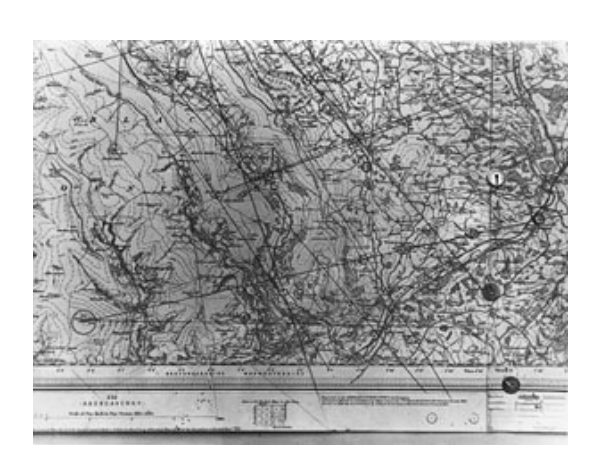
Fig. 6 Alfred Watkins Original Alignments Hereford Library no.1578g enlarge

Watkins's revelations reordered a lifetime's experience. As in the preface to his photography text, Watkins tells how the theory, he now realises, originated long ago, in Radnorshire, when as a lad travelling for his father's brewery he pulled up his horse look with wonder at two sites he now knows are linked, the Four Stones, standing stones in a field corner, and later the same day came the first view of Castle Tomen, marked by a clump of trees, at the summit of Radnor Forest road. 'The note of unsatisfied wonder struck that day has lingered through nearly fifty years' unusually intimate knowledge of our beautiful West country borderland, and I know now that my sub-conscious self had prepared the ground and worked at the problem I now see solved'.<sup>20</sup>