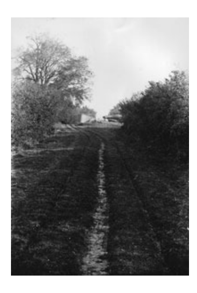
Fig.2 Alfred Watkins Arthur's Stone, Dorston, Green Way Sighted to and Beyond the Mound Black and white photograph, published as fig.14 of Alfred Watkins, The Old Straight Track, Methuen, 1925 Hereford Library no.264  enlarge

The Watkins revival occurred at the beginnings of the 'land art' movement in Britain. Richard Long (fig.3) first found out about ley-lines at the time of his solo exhibition at The Whitechapel Gallery in 1971: