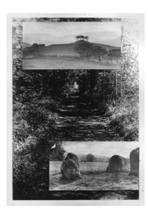
Fig.7 Alfred Watkins Collage of black and white photographs, published as frontispiece of Alfred Watkins, Early British Trackways, 1921 Hereford Library no.1578b

Watkins was not the first to entertain alignment views of the prehistoric culture. As Pennick and Devereux show, in many parts of northern Europe from the later eighteenth century, and with increasing frequency from the later nineteenth, when map use was more widespread, scholars of varying quality detected systems of lines in the landscape, especially in work on druidism, centuriation, old roads and ancient astronomy. This came to Hereford in 1870, at a meeting of the British Archaeological Association, in a lecture by William Henry Black, historiographer to the Public Record Office, who speculated on a global system of alignments in which he located some local sites. Watkins was just fifteen at the time, but did attend later meetings of the Woolhope Club when Black's ideas (largely forgotten by mainstream archaeology) were presented. *22 Early British Trackways* is close to a scientifically minded work like O.G.S. Crawford's *Man and *His Past* (1921)* in its focus on the openness of prehistoric landscape, on mobility and trading routes, particularly in the economic geography of minerals and metals, and its plotting of Roman Roads (Crawford's 'own particular groove') on Ordnance Survey maps, joining up surviving fragments in straight lines and then doing field work to discover remains along the alignment. *23*