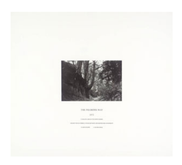
Fig.4 Hamish Fulton The Pilgrim's Way 1971 Photograph and text Presented by Tate Members 2003 © Hamish Fulton enlarge