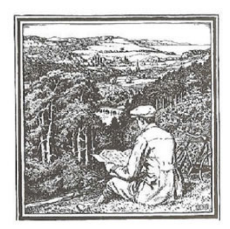
Fig.5 Ellis Martin Cover illustration to Popular Edition, Ordnance Survey 'One-Inch' map enlarge

The grid of ley-lines came to Watkins, he tells his readers, as a 'rush of revelations' on 30 June 1921, when on a visit to Blackwardine, a sighting from a hill-top led him to see on a map, before he saw it on the ground, a straight line linking various ancient sites. The map was probably the new Popular Edition of the Inch to One Mile Ordnance Survey Map which, on the front cover, had Ellis Martin's famous figure of the cyclist in Norfolk jacket, tweed cap and plus fours, looking over the landscape unfolded on his map from one hill to that in the distance (fig.5). Watkins followed up his revelation with further map-assisted hill sightings, 'unhampered by other theories', and found it 'yielding astounding results in all districts'. The theory could be verified, through what may seem a somewhat circular form of reasoning, 'on an inch to a mile ordnance map with the aid of a straight edge'. By sticking a steel pin on 'an undoubted sighting point' placing the straight edge against it and moving it around until several (not less than four) sites (including place names) came exactly into line (fig.6). Travelling along the line would reveal further sites not marked on maps, such as woodland glades, trenches, fragments of causeways and above all, otherwise unnoticed notches on the crest of hills.