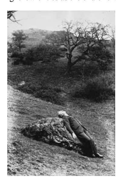
Fig.8 Alfred Watkins Sacrificial Stone, Aligning with Giant's Cave Above It Black and white photograph, published as fig.101 of Alfred Watkins, The Old Straight Track, Methuen, 1925 Hereford Library no.184

Ley-line seeking became something of a countryside craze and in 1927 Watkins issued a portable field guide The Ley Hunters Manual to cater for it. Admirers around the country, sixty-seven of them, formed a Straight Track Club, which not only met but corresponded (on the model of other postal contributory clubs, like the English Mechanic Photographic Club) circulating growing portfolios of work. This Club included some devotees of some of the more fringe diffusionist theories, taking in Egypt and Atlantis and the growing cult of Glastonbury.<sup>28</sup> Watkins continued to elaborate his theory until his death in 1935. To demonstrate his