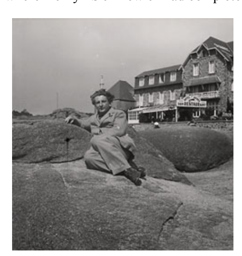
Fig.2 Eileen Agar 'Joseph and the Hotel de Guirec', Ploumanach 1936 Black and white photograph reproduced from original negative Tate Archive Photographic Collection 3.48.9 © Tate Archive 2005

At her death in 1991 Eileen Agar donated her photographs to the Tate Gallery Archives, some in the form of prints, many only as negatives. There are in all about seventy images made at Ploumanac'h – six films' worth – and their aesthetic and technical success is variable. As well as the rocks, Agar and Bard photographed each other: there is one image of him sitting (in suit and tie) on the rocky beach in front of their hotel (fig.2). <sup>10</sup> In Perros-Guirec, Agar photographed the asymmetrical church of St. Jacques, the butcher's shop of L. BOUBENEC next to it, as well as the Boubenec family tomb in the graveyard. She also visited and photographed the mock-gothic castle on the Ile de Costarès in the bay opposite Ploumanac'h, where Henryk Sienkiewicz had completed his mammoth biblical novel Quo Vadis in 1896. <sup>11</sup>