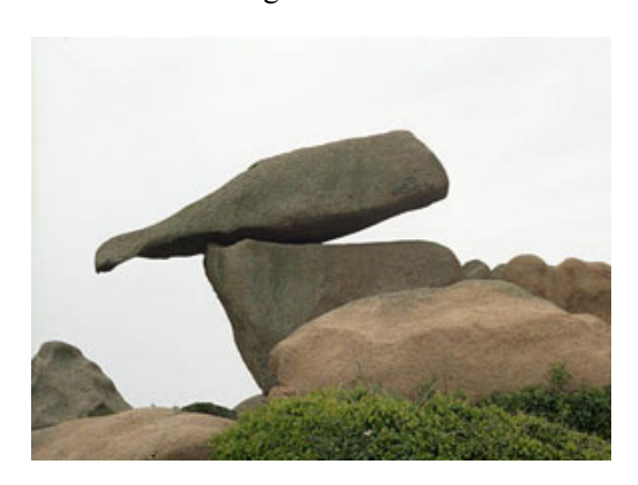
Fig.11 Ian Walker 'La Bouteille', Ploumanac'h 2004 Colour photograph

But this also emphasises the sense in which these namings – like photography – depend upon a two-dimensional reading of the rock's three-dimensional physicality. In many cases, the name given to a particular rock only makes sense from one particular angle. From the other side, it is something quite other. The rock known as 'La Bouteille' turned into something both more humorous and more sinister when Agar went round the other side and found a smudged face in the erosion of its base (fig.6, fig.11). There are indeed several examples in the Tate Archives where one might suspect that two images show the same rock from different angles but this could only be verified on site. One of Agar's rocks I was unable to find at Ploumanac'h – the one she titled 'Rockface' (fig.1). It could have been any one of hundreds of rocks, seen from just the right angle as one glanced toward it in just the right frame of mind. Photography, even of such solid things as rocks, often depends upon momentary conjunctions which quickly disappear if they are not grabbed straight away. Indeed, had she gone back the following day, Agar herself might not have been able to find 'Rockface' again. <sup>52</sup>