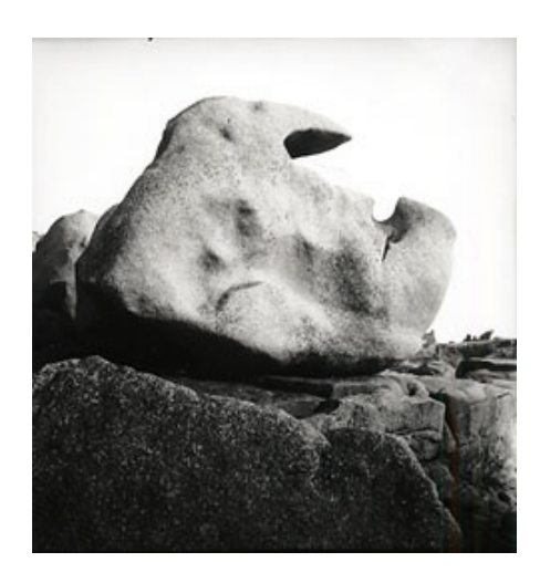
Fig. 1 Eileen Agar 'Rockface', Ploumanach 1936 Black and white photograph reproduced from original negative Tate Archive Photographic Collection 5.4.3 © Tate Archive 2005

On Saturday 4 July 1936, the International Surrealist Exhibition in London came to an end. In that same month, the Architectural Review magazine announced a competition. In April, they had published Paul Nash's article 'Swanage or Seaside Surrealism'. Now, in July, the magazine offered a prize for readers who sent in their own surrealist holiday photographs – 'spontaneous examples of surrealism discerned in English holiday resorts'. The judges would be Nash and Roland Penrose. <sup>2</sup>