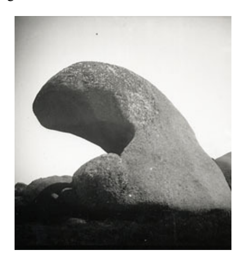
Fig. 8 Eileen Agar 'Rocks', Ploumanach 1936 Black and white photograph reproduced from original negative

Finding the individual rocks that Agar photographed also demonstrated something of her tactics. Both of the rocks in Figs. 8 and 9 are by the path across the headland and in both cases Agar has photographed them from low down to remove the background and emphasise their scale. Agar was quite short and she had the camera at waist level, but here she must have crouched or knelt down even further. This suggests a process of observation before she actually made the picture (a process which may also have affected her decision to make just one shot of each rock). In the final pictures the scale of two rocks is quite deceptive. The rock in Fig.8 is perhaps fifteen feet high, the one in Fig.9 five or six feet. In the photographs they both seem equally grand.