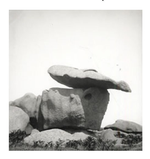
Fig.6 Eileen Agar 'Rocks', Ploumanach 1936 Black and white photograph reproduced from original negative

that separates Agar from the other English nature-artists and might signal her female undermining of their male pomposity. As the 'bum' ends in a 'thumb', as rocks seem to whisper to each other, as a smaller rock balances on a larger like some fashionable hat (fig.6),<sup>48</sup> one senses that Agar delights in the ridiculousness of her images, a ridiculousness created in the space between the sense of the rocks as simply rocks and her deliberate reading of them as heads and faces, bodies and monsters. Agar deliberately takes the 'pathetic fallacy' that can be so dangerously sentimental and plays with it to make images that are indeed sublime and at the same time carnivalesque – a 'comic sublime'.