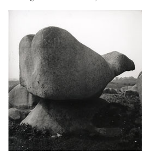
Fig.4 Eileen Agar 'Bum and Thumb Rock', Ploumanach 1936 Black and white photograph reproduced from original negative Tate Archive Photographic Collection 5.4.1 © Tate Archive 2005

In her account of the rocks, as in the photographs she took of them, Agar stressed their animistic qualities: 'They lay like enormous prehistoric monsters sleeping on the turf above the sea'. Both her description of the rocks and the titles she later gave some of them – 'Rockface', 'Bum and Thumb Rock' – transposed them into so many bodily parts (figs.1,4). Nevertheless, it was crucial for Agar that these forms were created by the forces of water, wind and chance. The 'surrealism' of natural form was an even more central concept for Agar than it was for Nash. Much later, she was to say: 'I am very much a nature-worshipper and I always try to bring nature into my work ... On the whole I feel that nature is something free. Nature can produce the most astonishing shapes that you could never dream of'. She continued by referring to the 'wild frenzy that Nature can show'. 39