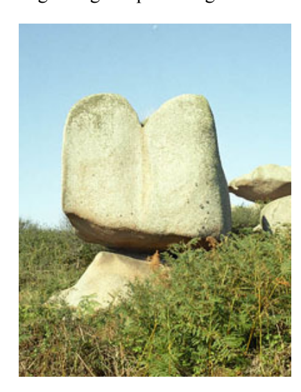
Fig.10 Ian Walker 'Les Tables de la Loi', Ploumanac'h 2004 Colour photograph

emphasise the metamorphic qualities that she had found in them and which are at odds with their common naming. The 'Bum and Thumb Rock' is actually known as 'The Tablets of the Law' because, when seen from end on, the 'bum' flattens out to resemble the double shape of the Ten Commandments (fig.10). (One can imagine Agar's quiet delight that she had managed to turn the tablets of the law into a bum.)