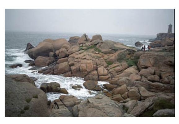
Fig. 7 Ian Walker Rocks, Ploumanac'h 2004 Colour photograph

Finding the individual rocks that Agar photographed also demonstrated something of her tactics. Both of the rocks in Figs. 8 and 9 are by the path across the headland and in both cases Agar has photographed them from low down to remove the background and emphasise their scale. Agar was quite short and she had the camera at waist level, but here she must have crouched or knelt down even further. This suggests a process of observation before she actually made the picture (a process which may also have affected her decision to make just one shot of each rock). In the final pictures the scale of two rocks is quite deceptive. The rock in Fig.8 is perhaps fifteen feet high, the one in Fig.9 five or six feet. In the photographs they both seem equally grand.