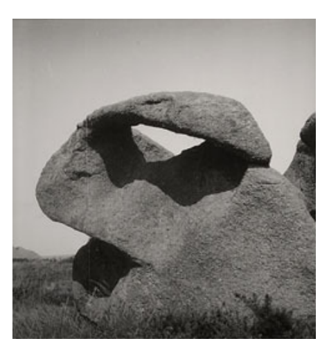
Fig. 9 Eileen Agar 'Le Lapin', Ploumanach 1936 Black and white photograph reproduced from original negative Tate Archive Photographic Collection 3.56.4

The other striking feature of Ploumanac'h is the fact that nearly all the major rocks have acquired names – 'le diable', 'la champignon', 'la tête de mort', 'la palette du peintre', 'le pied' and so on. On one level, this provides an enjoyably folkloric element to the experience of them. On another, however, it restricts the play of meaning, assigning just one identity to each rock. Agar was wise on the whole to avoid such overt (if tempting) naming of the rocks. Most of her images were factually titled: 'Rocks, Ploumanach, 1936'. In only one case – 'Le Lapin' – did Agar use the name already given to the rock and that she did as part of her own play with the rock's metamorphosis (fig.9). With a couple of other images, she gave the rocks names that