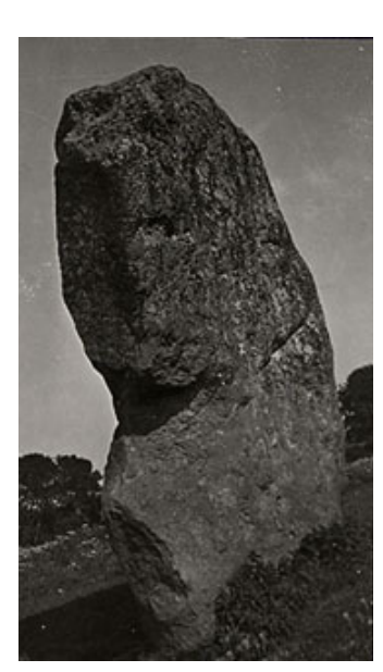
Fig.3 Paul Nash 'Avebury Sentinel' 1933 Black and white photograph Tate Archives 7050.Ph.114 © Tate Archive 2005

If Nash's influence was formative in Agar's decision not to sketch or paint these rocks but to photograph them, one might also recall Nash's habit of collecting stones, such as the Nest of Wild Stones which he found that same year. But those rocks were tiny, hand-sized; part of the effect of Ploumanac'h lay in its scale. In terms of size and animistic presence, the closest parallel we might find is in the standing stones of Avebury which Nash had photographed in 1933 (fig.3) (Agar herself went there later in 1939). Agar described one rock at Ploumanac'h as 'a foot rearing up like a dolmen', and there are several rocks which are reminiscent of standing stones. There is a particular resonance to her making the connection between natural forms and man-made prehistoric forms in Brittany, where dolmens and megaliths abound and do indeed become part of the natural landscape. However, as we shall see, it was crucial for Agar that these forms were not man-made but natural, 'sculpted by the sea, that master-worker of all time'.