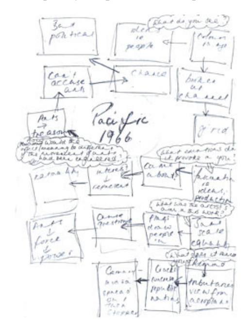
Fig.2 A response by Alison Mawle to Pacific , 2000, by Yukinori Yanagi (Tate)

Thus, the process of developing interpretations was achieved through expanding on personal responses and building up new habits of looking at art through a programme of activity centred teaching in the gallery. All of the activities were designed to foster a community of enquiry, in which discussion and debate were integral and each person's ideas were equally significant. The following examples take each of the frameworks for looking and demonstrate how an activity for each was used to give looking, and consequently the process of interpretation, more depth and breadth.