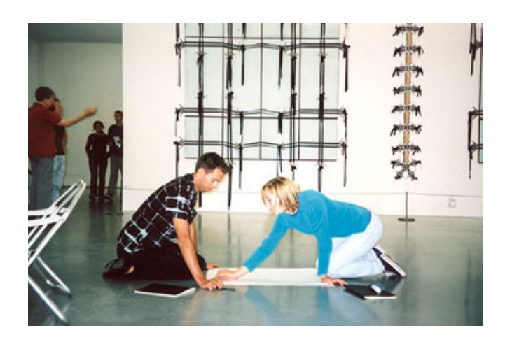
Fig.1 Participants in Tate Modern's Summer Institute mapping connections between works shown in the History, Memory, Society suite, 2002 Helen Charman