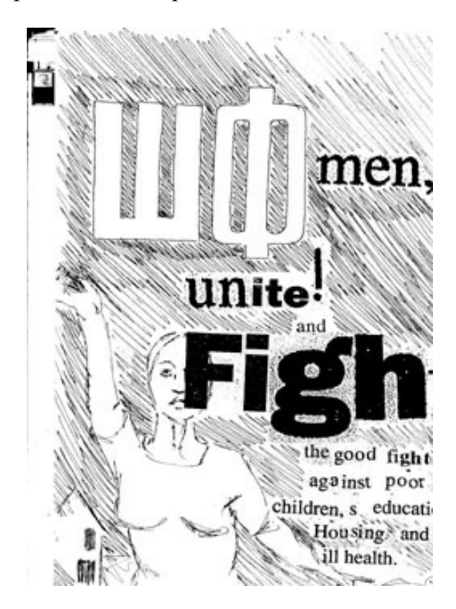
Fig.5 Looking at the Object. A response (no name given) to a poster in the Soviet Graphics display at Tate Modern

poster of their choice. Through doing so they connected the 'what' of the work – what do I see in front of me? with the 'how' of the work – how has the artist used their materials and the formal language of image making to convey meaning? Learning took place through the experience of re-making the art work, a visual process of interpretation.