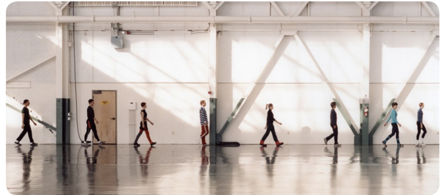
Tacita Dean Craneway Event 2009, 16mm film still.

Through disparate references, involving Shakespeare through to Hollywood, these films use performance and gesture to provoke and engage.