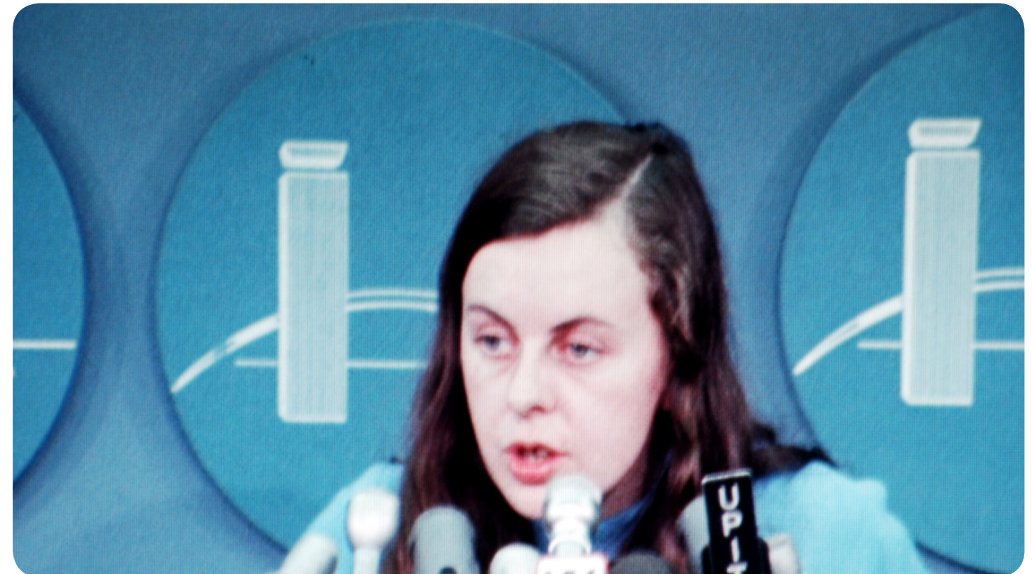
Duncan Campbell, Bernadette 2008, video still Tate. Presented by Tate Patrons 2010

This programme examines the complexities of nationalism, propaganda and personal memory through documentary and archive footage.