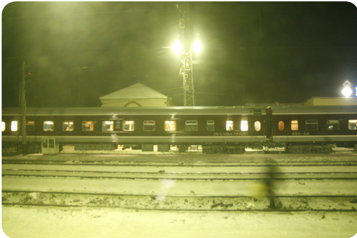
Sarah Turner, Perestroika 2009, video still Courtesy the artist. © Sarah Turner