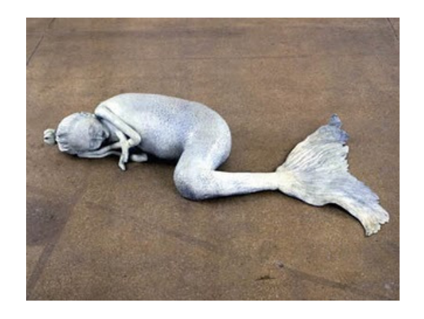
Liz Craft Old Maid 2004