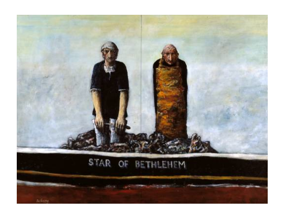
John Bellany Star of Bethlehem 1966 Tate © the estate of John Bellany

Standing in Gallery 5, on the coastline of Aquatopia , we are looking at what has been drawn out of the ocean to less familiar territories of the shore.