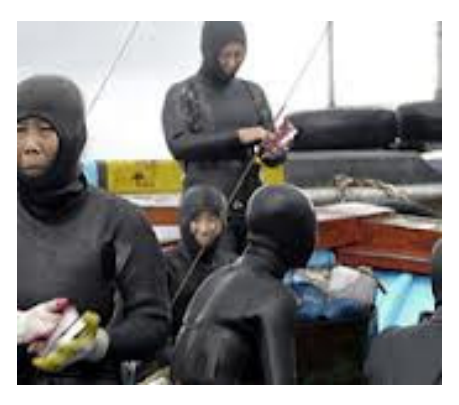
Mikhail Karikis Sea Women 2012

Can a film be a piece of art and should it be in a gallery?