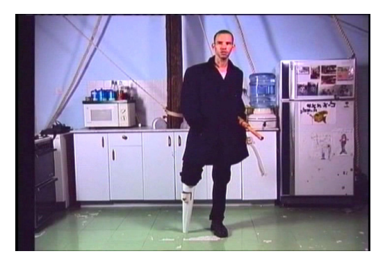
Guy Ben-Ner Moby Dick 2000 Courtesy of the artist & Gimpel Fils, London © The artist

You could compare his version to the original story after your visit. Which version do you like best? Why?