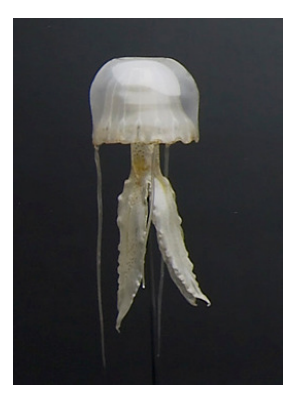
Rudolf and Leopold Blaschka Pelagia cyanella 19th century

In Gallery 3 we look beneath the ocean to see beautiful creatures, but also human tragedy - explored in the Ottolith Group's film Hydra Decapita that deals with slavery, global finance and climate change.