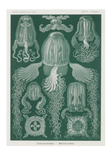
Ernst Haeckel Prints from Kunstformen der Natur 1899–1904