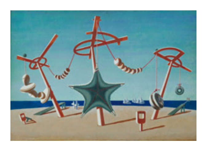
Edward Wadsworth The Beached Margin 1937