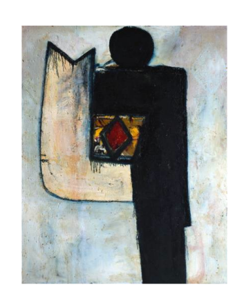
Alan Davie Image of The Fish God 1956 Tate © Alan Davie

In this gallery there are lots of artworks of sea creatures. Which do you think are real and which are imaginary?