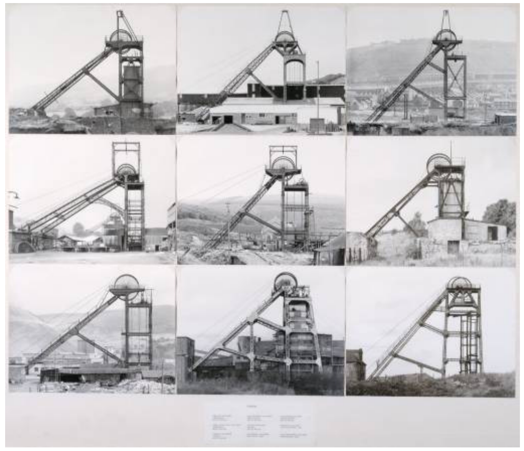
Fig.1 Bernd Becher and Hilla Becher Pitheads 1974

Bernd and Hilla Becher first began their still-ongoing project of systematically photographing industrial structures – water towers, blast furnaces, gas tanks, mine heads, grain elevators and the like –in the late 1950s.<sup>1</sup> The seemingly objective and scientific character of their project was in part a polemical return to the 'straight' aesthetics and social themes of the 1920s and 1930s in response to the gooey and sentimental subjectivist photographic aesthetics that arose in the early post-war period. This latter position was epitomised in Germany by the entrepreneurial, beauty-in-the-eye-of-the-beholder humanism of Otto Steinert's subjektive fotografie – "Subjective photography",' wrote Steinert in his founding manifesto, 'means humanised, individualised photography' – and globally by the one-world humanism of The Family of Man .<sup>2</sup> While many photographers followed Robert Frank's critical rejoinder and depicted the seamier, chauvinistic underbelly of the syrupy universalisms advocated for by Steichen and Steinert, the Bechers simply rejected it and returned to an older, pre-war paradigm (fig.1).