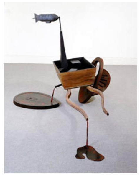
Bill Woodrow Refugee 1989