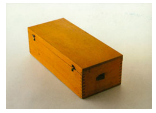
Fig.11 William Furlong An Imagery of Absence 1999 © William Furlong

AW Bill found this box in a market near Münster, in Germany, and inside it were glass plate negatives