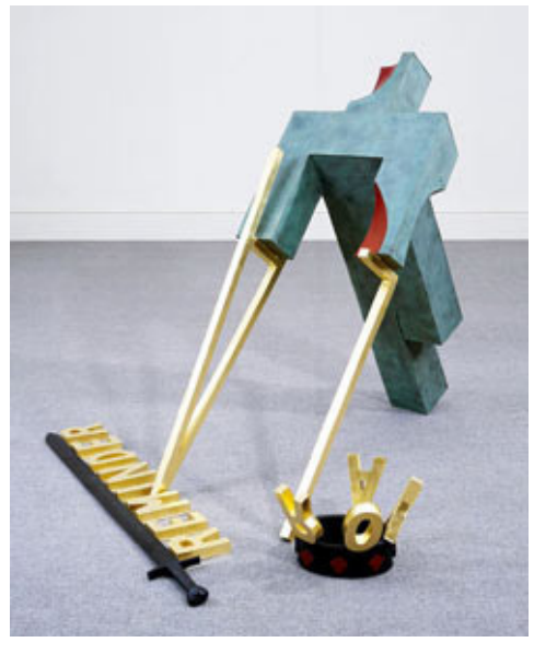
Bill Woodrow For Queen & Country 1989 @ Bill Woodrow