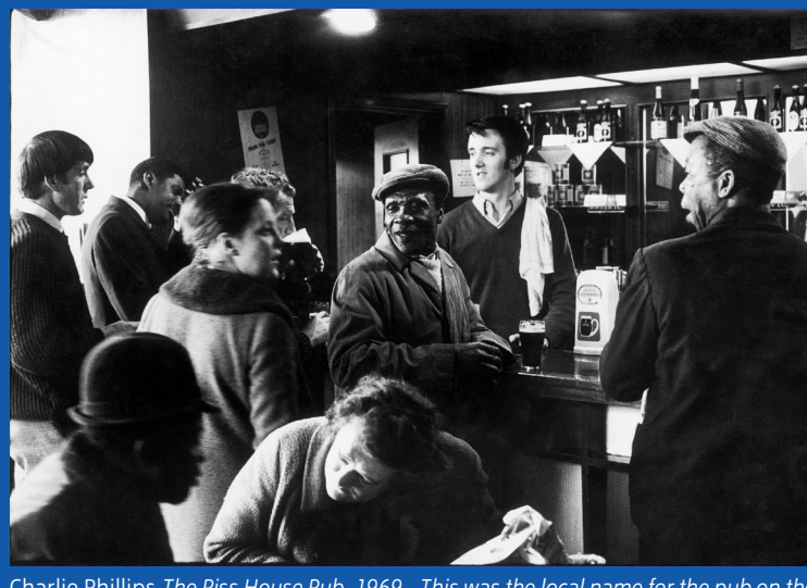
Charlie Phillips The Piss House Pub, 1969 - This was the local name for the pub on the corner of Blenheim Crescent and Portobello Road 1969

GET £10 TICKETS UNTIL 21 MARCH 2022 WITH PROMO CODE LONDONMAP10 AT TATE.ORG.UK*