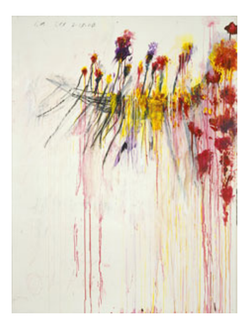
Fig.16 Cy Twombly Coronation of Sesostris 2000, panel 5 Acrylic, crayon, and pencil on canvas

Twombly's 'interpreted' poem, 'When the gods depart' – gorgeously decorated with his late Mannerist explosions of crimson flowers or liquid fireballs (fig 17) – serves as a hinge between the flaming barge and its dissolution into a burnt-out skeleton (fig.18). The scrawled text provides an epigraph for the series: 'they' (the gods) are leaving, glorious but unheeded, as the mortal body sinks into oblivion, scarcely registering their passing. Nunc est bibendum : sorrows are drowned, the boat is a drunken boat, the poem a scribbled memo-to-self, a scarcely legible scrawl with its bursts and drips of paint. The blazing barge dissolves into its own reflection, melting into shadowy, Turneresque reflections in an exquisite coalescing of self-quotation and reminiscence as it sinks beneath the waves (figs.19, 20).<sup>51</sup> With the burnt-out stick-ship, the ideograph becomes minimal, like the shadowy Celtic boat, the canvas emptied of colour, the writing undulating and (literally) vague: 'leaving Paphos ringed with waves' (fig.20).<sup>52</sup>