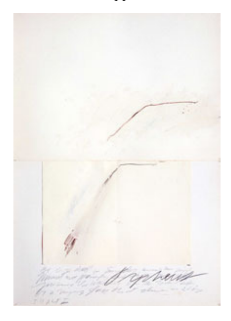
Fig.4 Cy Twombly Orpheus 1975

Twombly's letter-painting Orpheus , 1979 (fig.3) – the same year as his sculpture – opens its initial O to form the basic apostrophic sign of song, spelling out the rest of the name in Greek letters with a random, shaky line, scattering them across an empty surface. Describing space in Twombly's work, Barthes uses the term 'rare' (Latin, rarus ): 'that which has gaps or interstices, sparse, porous, scattered'. <sup>26</sup> An earlier Orpheus , 1975 (fig.4), combines the motif of the broken line with another quotation from Rilke's Sonnets to Orpheus – the 'ringing glass that shatters as it rings' – in a poignant geometry of line and smudge. <sup>27</sup> The broken sapling of Twombly's Untitled sculpture of 1987 (fig.5) contains another Orphic reference to the first of Rilke's Sonnets ('There rose a tree'). On the pedestal is a small sign bearing an epigraph from the tenth and last of Rilke's Duino Elegies : 'And we who have always thought of happiness climbing, would feel the emotion that almost startles when happiness falls.' <sup>28</sup>