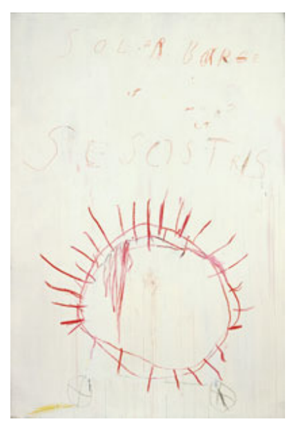
Fig.13 Cy Twombly Coronation of Sesostris 2000, panel 2 Acrylic, crayon, and pencil on canvas Courtesy Gagosian Gallery, New York © Cy Twombly