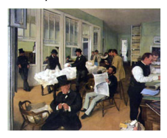
Fig.22 Edgar Degas Cotton Exchange in New Orleans 1873 Musée Municipal de Pau, France

unknown. The ascending step motif or metric, present in other Twombly paintings and drawings, surfaces as an indecorous quotation of the silhouetted top-hat in Degas's painting Cotton Exchange in New Orleans (fig.22): 'So how it got in there, I don't know'. <sup>54</sup> Perhaps Twombly's eye was drawn to the dazzling commerce in whiteness at the heart of Degas's picture. He is, after all, a Southern painter.