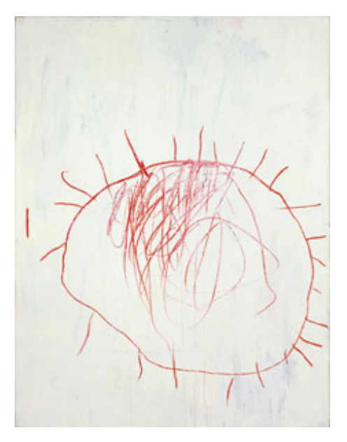
Fig.12 Cy Twombly Coronation of Sesostris 2000, panel 1 Acrylic, crayon, and pencil on canvas