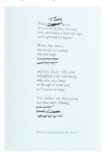
Fig.11 'Poem as interpreted by the artist' [Cy Twombly, Coronation of Sesostris (New York: Gagosian Gallery, 2000), p.29] Courtesy Gagosian Gallery, New York © Cy Twombly

Twombly's ten-part Coronation of Sesostris , 2000, is the culminating synthesis of his ship ideographs and whirling expeditionary chariots: a blazing, triumphal departure that burns itself out on the far side of the Nile. Begun in Gaeta and completed in Virginia, it combines deceptive simplicity with painterly sophistication and poetic adaptation. Twombly calls this multi-media series (drawn, written, painted) one of his favourite sets and 'very personal'. <sup>46</sup> It incorporates a poem of 1996 by the Southern poet Patricia Waters, not a translation this time, although its title ('Now is the Drinking') translates Nunc est bibendum (fig.11). <sup>47</sup> With a few strokes and deletions, Twombly 'interprets' the poem to create his own reticent version: