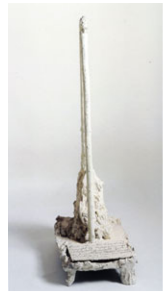
Fig.5 Cy Twombly Untitled 1987