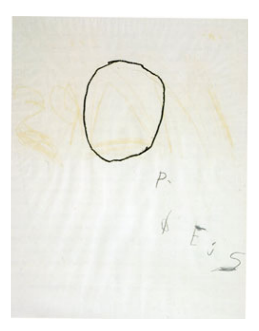
Fig.3 Cy Twombly Orpheus 1979 Oil, crayon and pencil on paper Private collection © Cy Twombly

Twombly's letter-painting Orpheus , 1979 (fig.3) – the same year as his sculpture – opens its initial O to form the basic apostrophic sign of song, spelling out the rest of the name in Greek letters with a random, shaky line, scattering them across an empty surface. Describing space in Twombly's work, Barthes uses the term 'rare' (Latin, rarus ): 'that which has gaps or interstices, sparse, porous, scattered'. <sup>26</sup> An earlier Orpheus , 1975 (fig.4), combines the motif of the broken line with another quotation from Rilke's Sonnets to Orpheus – the 'ringing glass that shatters as it rings' – in a poignant geometry of line and smudge. <sup>27</sup> The broken sapling of Twombly's Untitled sculpture of 1987 (fig.5) contains another Orphic reference to the first of Rilke's Sonnets ('There rose a tree'). On the pedestal is a small sign bearing an epigraph from the tenth and last of Rilke's Duino Elegies : 'And we who have always thought of happiness climbing, would feel the emotion that almost startles when happiness falls.' <sup>28</sup>