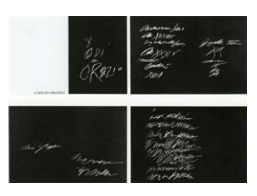
Fig. 1 Cy Twombly 8 Odi di Orazio 1968 Screenprint Pl. I-IV © Cy Twombly

Lines and phrases – like inscriptions – create genealogies and force fields of allusion. Twombly says he turned to the poets 'because I can find a condensed phrase ... My greatest one to use was Rilke [...]. I always look for the phrase.' Linked by the legacies of expatriate sensibility and high modernism, Rainer Maria Rilke (1875–1926) and Twombly are also drawn to the richly sedimented Nile region. Both took trips up the Nile to escape the European winter, like other wealthy Europeans in search of the sun. Ancient Egypt is an assemblage of imaginary meanings and colonial expropriation, archaeology and tourism. For Rilke, it was associated especially with poetry, mourning, and the cult of the dead. For Twombly (drawn to epic and historical themes as well as lyric poetry), militarism and conquest converge at the meeting-point of Middle East and western Mediterranean cultures. Hence 'time-lines'.