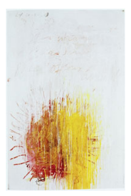
Fig.14 Cy Twombly Coronation of Sesostris 2000, panel 3 Acrylic, crayon, and pencil on canvas Courtesy Gagosian Gallery, New York © Cy Twombly