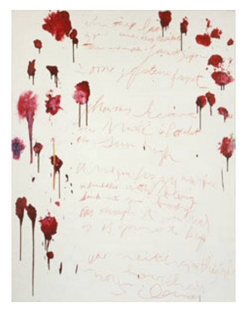
Fig.17 Cy Twombly Coronation of Sesostris 2000, panel 6 Acrylic, crayon, and pencil on canvas

Twombly's 'interpreted' poem, 'When the gods depart' – gorgeously decorated with his late Mannerist explosions of crimson flowers or liquid fireballs (fig 17) – serves as a hinge between the flaming barge and its dissolution into a burnt-out skeleton (fig.18). The scrawled text provides an epigraph for the series: 'they' (the gods) are leaving, glorious but unheeded, as the mortal body sinks into oblivion, scarcely registering their passing. Nunc est bibendum : sorrows are drowned, the boat is a drunken boat, the poem a scribbled memo-to-self, a scarcely legible scrawl with its bursts and drips of paint. The blazing barge dissolves into its own reflection, melting into shadowy, Turneresque reflections in an exquisite coalescing of self-quotation and reminiscence as it sinks beneath the waves (figs.19, 20).<sup>51</sup> With the burnt-out stick-ship, the ideograph becomes minimal, like the shadowy Celtic boat, the canvas emptied of colour, the writing undulating and (literally) vague: 'leaving Paphos ringed with waves' (fig.20).<sup>52</sup>