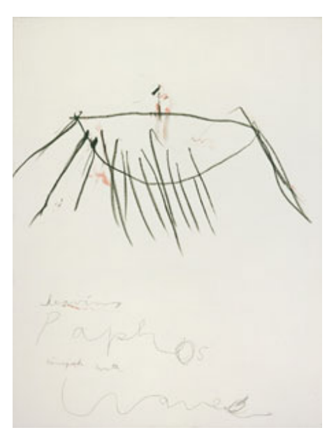
Fig.20 Cy Twombly Coronation of Sesostris 2000, panel 9 Acrylic, crayon, and pencil on canvas Courtesy Gagosian Gallery, New York © Cy Twombly