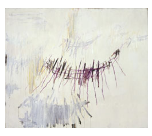
Fig.19 Cy Twombly Coronation of Sesostris 2000, panel 8 Acrylic, crayon, and pencil on canvas Courtesy Gagosian Gallery, New York © Cy Twombly

Courtesy Gagosian Gallery, New York © Cy Twombly