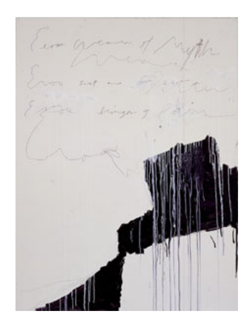
Fig.21 Cy Twombly Coronation of Sesostris 2000, panel 10 Acrylic, crayon, and pencil on canvas Courtesy Gagosian Gallery, New York © Cy Twombly

Twombly's farewell to Eros and the good life quotes, not Archilochos (general and mercenary, as Twombly recalls), but the late Bronze Age poet-warrior, Alkman, who survives only in fragments and phrases. The lines announce a departure from Cyprus (island of love) and Paphos, sacred to Aphrodite: 'Leaving Kypros the lovely /And Paphos ringed with waves.' The solar journey comes to an abrupt halt with a monumental end-stop, and a now-legible epigraph: 'Eros, weaver of Myth ... Eros bringer of pain' (fig.21). The Gods have departed, along with love. The western bank of the Nile with its blockish steps and temple confronts the viewer with a non-negotiable step into the