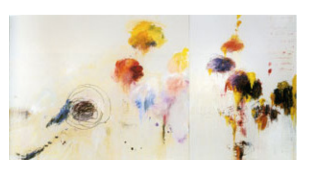
Fig.7 Cy Twombly Untitled (Say Goodbye, Catullus, to the Shores of Asia Minor) 1994 Oil, acrylic, crayon, oil stick, pencil, and coloured pencil on canvas © Cy Twombly