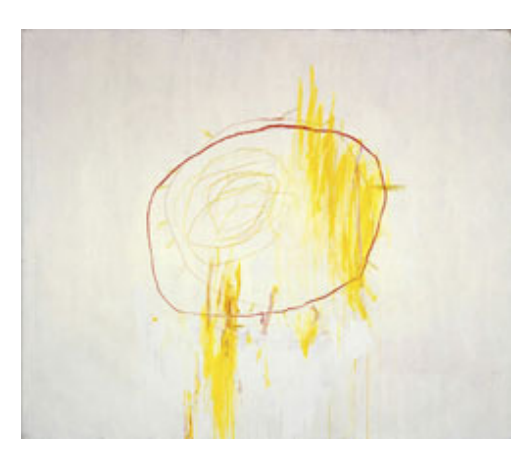
Fig.15 Cy Twombly Coronation of Sesostris 2000, panel 4 Acrylic, crayon, and pencil on canvas Courtesy Gagosian Gallery, New York © Cy Twombly