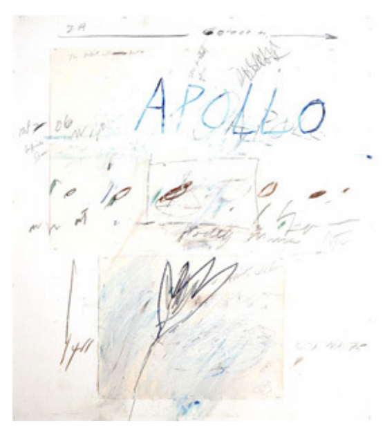
Fig.6 Cy Twombly Apollo and the Artist 1975 Oil paint, wax crayon, pencil and collage Courtesy Gagosian Gallery, New York © Cy Twombly

Twombly playfully self-identifies with the bucolic poet of the lyric tradition: 'I am Thyrsis of Aetna, blessed with a tuneful voice' ( Thyrsis , 1977). A 1968 photograph has him in the same shepherd's pose, leaning against a tree, as the reproduction of Cima's Orpheus that hung over Rilke's desk while he was composing the Orpheus sonnets. Much has been made of Twombly's graphic and sometimes playful self-signing.