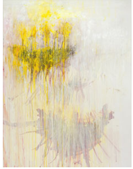
Fig. 18 Cy Twombly Coronation of Sesostris 2000, panel 7 Acrylic, crayon, and pencil on canvas