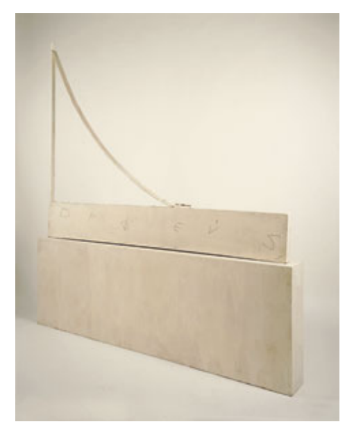
Fig.2 Cy Twombly Orpheus (Du Unendliche Spur) 1979 Wood, nails, white paint and pencil The Glenstone Foundation © Cy Twombly

Roland Barthes famously wrote of Twombly: 'His work is based not upon concept (the trace ) but rather upon an activity ( tracing )'. <sup>22</sup> In Twombly's graphic art, the trace is the record of a gesture. Barthes again: 'line is action become visible'. <sup>23</sup> Like Olson, Twombly connects heart to line via the body. Rilke's phrase, 'You unending trace' (' Du unendliche Spur' ) provides the subtitle of Twomby's sculpture, Orpheus , 1979, (fig.2). <sup>24</sup>