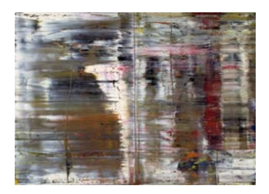
Fig.9 Gerhard Richter Abstract Painting 726 1990 Tate © Gerhard Richter

Another intensification of Tarkovsky's cinematic Zone is Jeremy Millar's film Ajapeegel (2008), shot on the very location of Stalker , a disused hydroelectric power plant outside Tallinn in Estonia (fig. 10).