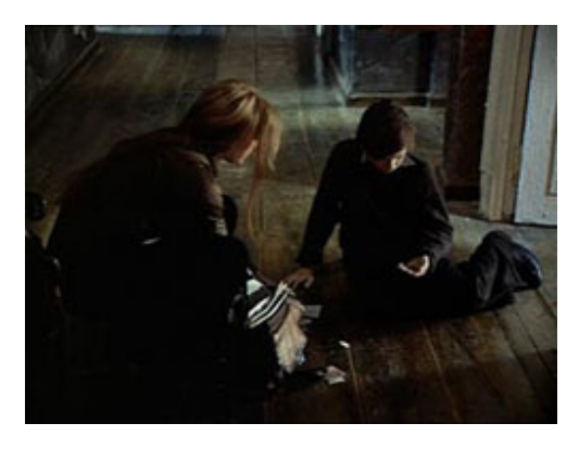
Fig.3 Ignat picks up the spilt coins in Mirror 1975, by Andrei Tarkovsky © The Estate of Andrei Tarkovsky