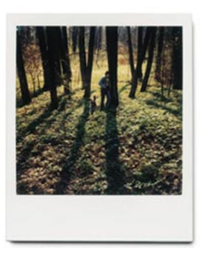
Fig.5 Polaroid photograph by Andrei Tarkovsky © The artist

Tarkovsky's growing interest in alternative media is evident in his Polaroid photography (fig.5), recently exhibited and collected. <sup>13</sup> With its temporal inflexibility, restricted focus and artificial colour, the shortcomings of the Polaroid camera would seem to be antithetical to Tarkovsky's 35mm cinema; the same goes for its virtues, notably its portability and spontaneity, which had not been hallmarks of Tarkovsky's cinematic art. By dint of their uniform size, sterile white borders and inherent instability, Polaroid prints challenge the exalted estimation of the art object in Tarkovsky's writings; one sees Tarkovsky struggling to adapt to the constraints of the new medium and exulting in the new vision of his familiar world. Tarkovsky's Polaroids are notably different from the photographs of Chris Marker, for instance, whose emphasis always is on the shared regard between the camera and human (and sometimes animal) faces, which express an irretrievable moment, 'the moment of certainty'. <sup>14</sup> Tarkovsky, by contrast, photographed landscapes and street scenes in which nothing decisive seems to be occurring at all. Human figures are shown in classical poses, which seen through the optics of the Polaroid make them reminiscent of Gerhard Richter's gauzy rendition of paintings in his Annunciation after Titian or of photographs in Elizabeth I or A Girl Reading (fig.6).