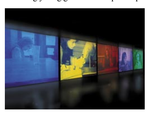
Fig.7 Susan Hiller Psi-Girls1999 Commissioned by Delfina Gallery/Millwall Productions, London Tate © Susan Hiller; Courtesy Timothy Taylor Gallery, London

Quite different is the appropriation of Tarkovsky in Psi-Girls (1999), where Susan Hiller includes an excerpt from Stalker in a simultaneous display of five episodes from contemporary film featuring young girls with telepathic powers.