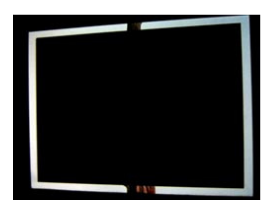
Fig.11 Mark Wallinger Via Dolorosa 2002

Unlike the Black Square of the Russian constructivist painter Malevich, overtly referenced by Wallinger, Via Dolorosa retains the promise of representation even as it denies the viewer easy visual gratification, thereby dramatising the role of narrative (whether inherent or external to the work) in filling in the empty spaces in the representation. Continuity is promised even as it is withheld; indeed, the withholding of visual pleasure promises continuity above and beyond the merely visible. Wallinger thus allows for a re-examination of Godard's and Rancière's equation of cinema projection and Veronica's veil. The direct imprint of reality is not only given at several degrees of removal; to retrieve it requires negating the very projection that makes it visible in lieu of – in hope of – a purer visibility.