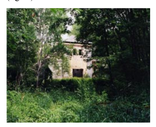
Fig.10 Jeremy Millar Ajapeegel 2005

Another intensification of Tarkovsky's cinematic Zone is Jeremy Millar's film Ajapeegel (2008), shot on the very location of Stalker , a disused hydroelectric power plant outside Tallinn in Estonia (fig. 10).