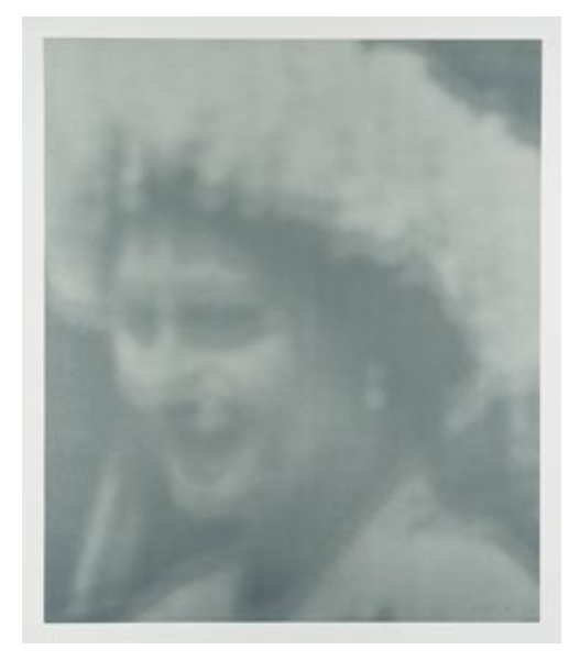
Fig.6 Gerhard Richter Elizabeth I 1966 Tate © Gerhard Richter

Tarkovsky's growing interest in alternative media is evident in his Polaroid photography (fig.5), recently exhibited and collected. <sup>13</sup> With its temporal inflexibility, restricted focus and artificial colour, the shortcomings of the Polaroid camera would seem to be antithetical to Tarkovsky's 35mm cinema; the same goes for its virtues, notably its portability and spontaneity, which had not been hallmarks of Tarkovsky's cinematic art. By dint of their uniform size, sterile white borders and inherent instability, Polaroid prints challenge the exalted estimation of the art object in Tarkovsky's writings; one sees Tarkovsky struggling to adapt to the constraints of the new medium and exulting in the new vision of his familiar world. Tarkovsky's Polaroids are notably different from the photographs of Chris Marker, for instance, whose emphasis always is on the shared regard between the camera and human (and sometimes animal) faces, which express an irretrievable moment, 'the moment of certainty'. <sup>14</sup> Tarkovsky, by contrast, photographed landscapes and street scenes in which nothing decisive seems to be occurring at all. Human figures are shown in classical poses, which seen through the optics of the Polaroid make them reminiscent of Gerhard Richter's gauzy rendition of paintings in his Annunciation after Titian or of photographs in Elizabeth I or A Girl Reading (fig.6).