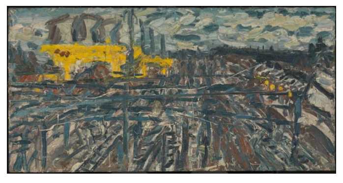
Top: From Constable: Salisbury Cathedral from the Meadows (plate 1) 1996–7 Middle: Christ Church, Spitalfields, Morning 1990 Bottom: Willesden Junction, Morning in October 1971 Leon Kossoff (b. 1926) © Leon Kossoff