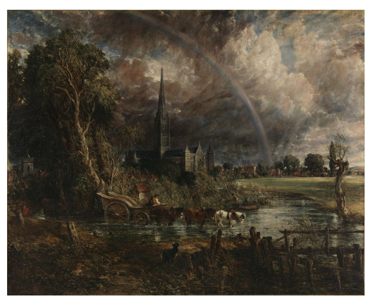
Salisbury Cathedral from the Meadows 1831 John Constable (1776 – 1837) Purchased with assistance from the Heritage Lottery Fund, The Manton Foundation, Art Fund (with a contribution from the Wolfson Foundation) and Tate Members.

1. What three words describe the Salisbury Cathedral from the Meadows painting for you? Ambitious, dramatic, ambiguous.