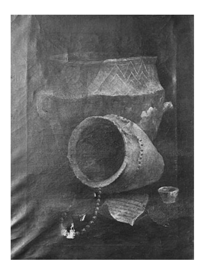
Fig.4 Thomas Guest Two biconical urns from a barrow in Winterslow 1814 oil