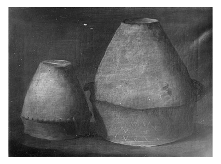
Fig.2 Thomas Guest Two Bronze Age urns [now in Ashmoleum] excavated from barrows at Winterslow, Wiltshire 1814 oil on canvas