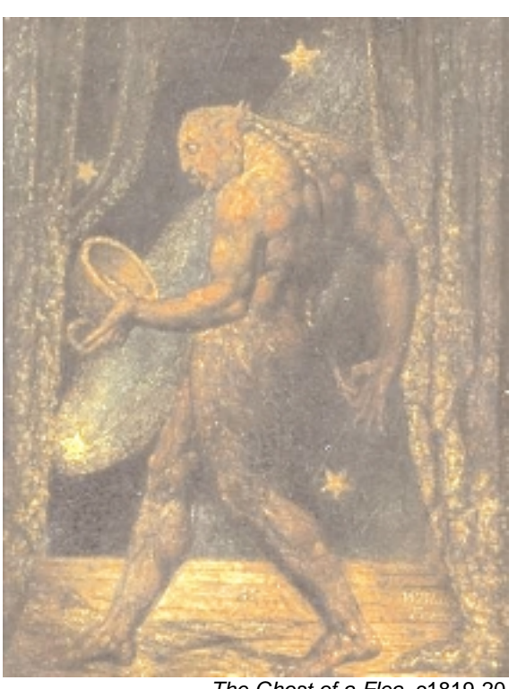
The Ghost of a Flea, c1819-20

There he comes! his eager tongue whisking out of his mouth, a cup in his hand to hold blood and covered with a scaly skin of gold and green.