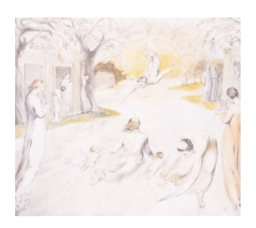
The River of Life, c1803

Blake believed that the creative spirit, which he links with imagination, was present in every living thing, so that all nature partakes of this divine spark. Blake's images reflect this, as in his watercolour of The River of Life , painted c1803 which loosely illustrates Revelation 22, 1-2 where The River of Life proceeding from the Throne of God is mentioned. For Blake, rivers, trees, even the mildew destroying ears of wheat that are illustrated in Europe, are seen as aspects of humanity.