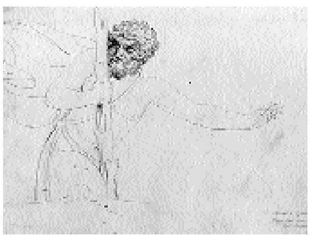
Charon, copy from the antique? c1779-80?

Blake's interest in the antique can be seen in his drawing of Charon, which seems to have been copied from an antique model, although the original has not been identified. Blake's preference for the linear forms of the Neoclassical is also evident in his writings. The Descriptive Catalogue of Pictures which Blake wrote to accompany an exhibition of his paintings in 1809 reveals his contempt for the type of paintings favoured by the artistic establishment in the eighteenth and early nineteenth centuries: